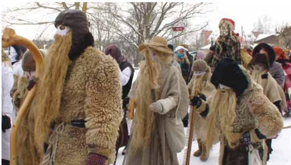
Figure 1. The vecīši group. The 12 th International Festival of Mask Traditions in Viesīte, Latvia, 12 February 2011.

light flow of energy and information. Every project is a creative, dynamic process for us, and all of us are winners, in an equal manner, I'd say: the richer each one's individual experience, the fuller our understanding of the event. (Interview 1)