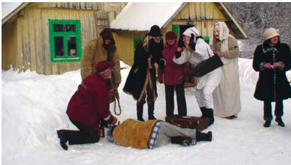
Figure 2 The kaitas mask group. The 12 th International Festival of Mask Traditions in Viesīte, Latvia, 12 February 2011.

behaviours can be copied from that mask group, although some of them still remember the kaitas processions. The interest of the participants in learning the kaitas tradition is genuine: