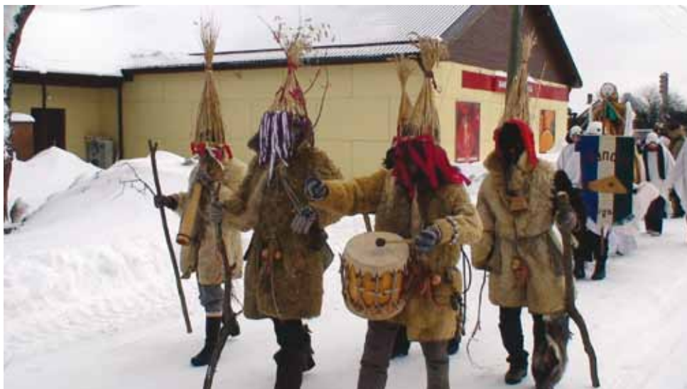
Figure 3. The budēļi group. The 12 th International Festival of Mask Traditions in Viesīte, Latvia, 12 February 2011.

good emotions from the masked processions. It is the realization that you're a messenger of spring, a rouser, a fosterer of fertility. By wearing the budēļi costume, just a little tipsy from alcohol, entering a different state through noise and movement, I feel special, I'm a budēļis " (Interview 4).