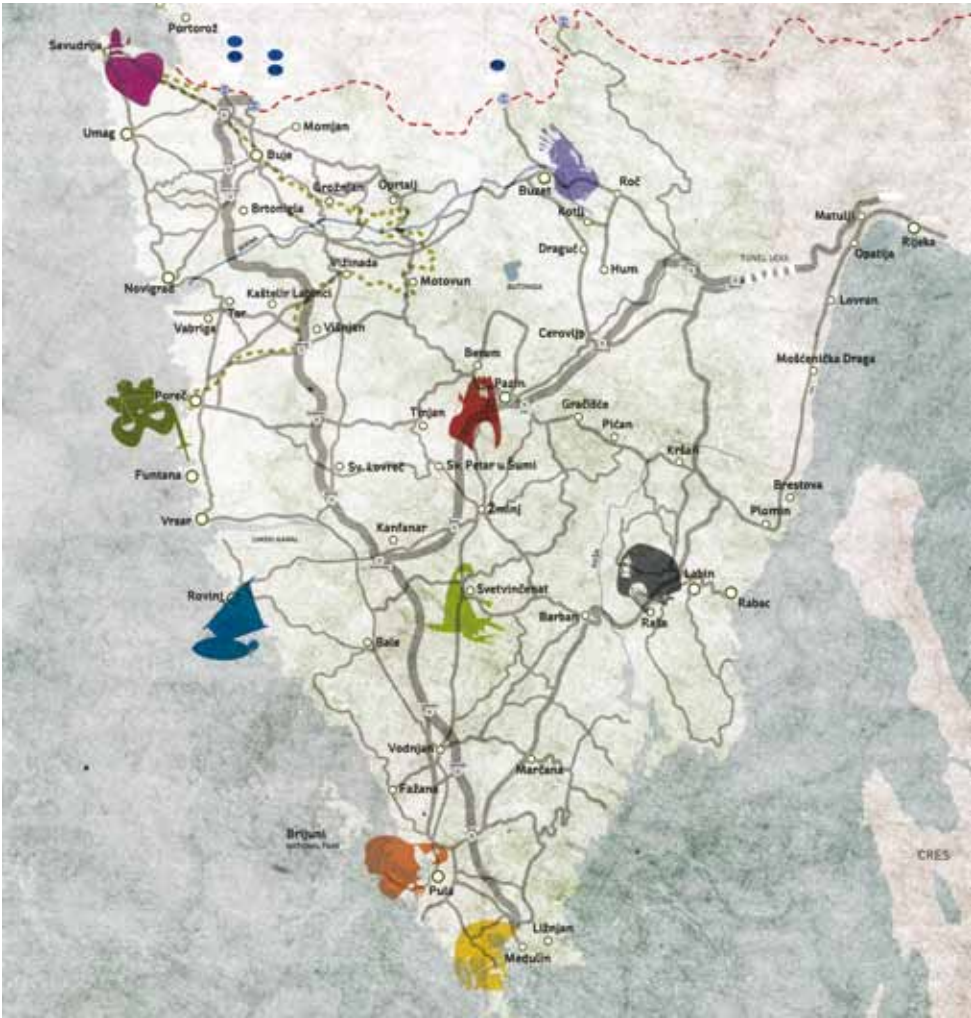
Figure 4. “Istrainspirit” links different organizations in Croatian Istria and advertises their cultural events connected with local narrative and historical tradition.

legends and myths of Istria) yearly from the year 2006 onwards – either at the end of July or beginning of August – in Pićan, the small town between Labin and Pazin under Učka mountain. 8 After the event, they also publish a publication titled Legende i priče Istre (Legends and tales of Istria). It would be good if they stressed more existing regional and local traditions during this event because nowadays folk tales from all countries and nations are being told at akin festivals. The Croatian authorities are planning to establish in Pićan a Museum of Intangible Heritage, and this could be a good example for other cultural organizations and institutions in other parts of Istria.