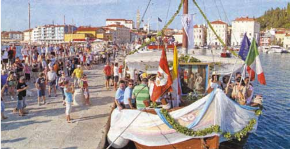
Figure 2. Pilgrimage on the boat, carrying the image of St. Mary back to Strunjan ( Družina 34 , 26. 8. 2012).