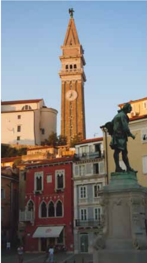
Figure 3. The red house in Piran “Benečanka” (Venetian lady) with the inscription Lasa pur dir (Let them speak) in the relief.