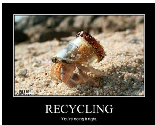
Figure 2: Combination of photo and short text

shape the mindsets, forms of behavior, and actions of social groups (Shifman 2014: 18); the cultural information that passes along from person to person gradually scales into a shared social phenomenon. These memes either try to show environmental problems with an attempt to persuade the viewer to behave as a more responsible member of society, or again use waste and dirt as metaphorical elements in the message.