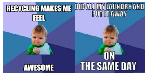
Figure 4: The same image supports the messages of different texts