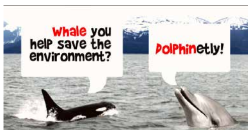
Figure 1: Wordplay with puns