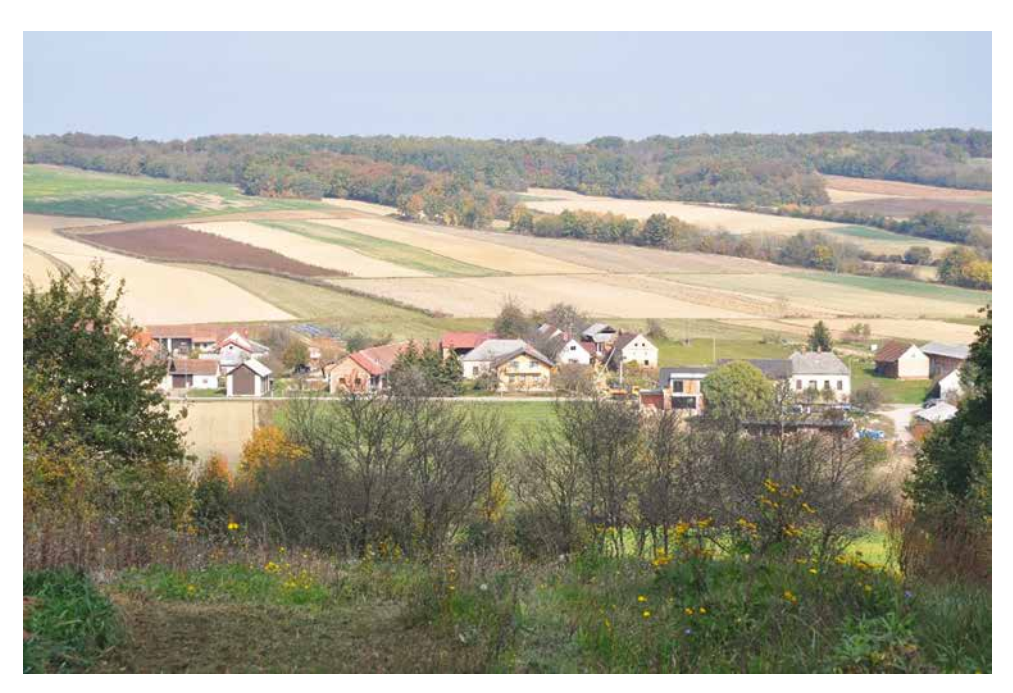
Figure 6: Agricultural landscape after land consolidation on the northern slope, view from Old Peak. The trees at the bottom grow along the Little Krka River. Photo: Peter Simonič, October 2018.