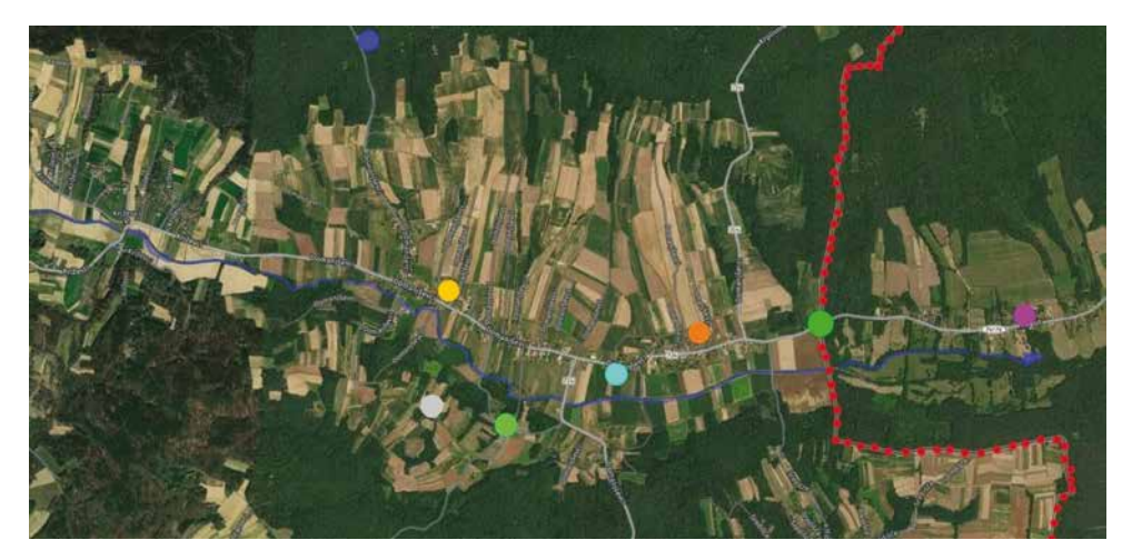
Figure 7: Domanjševci today. The red line is the border, and the blue line the flow of the Little Krka. The dots indicate today's shared water source at Mali vodnjak (dark blue), shared with Šalovci; the location of nineteenth-century Domanjševci (yellow) and Bükalja (orange); the border crossing with Hungary (dark green), and the nineteenth-century village of Szomoróc (violet); the new Hungarian Self-Governing Ethnic Community Center (light blue); the Lutheran church (light green), and Saint Martin's Church (gray).