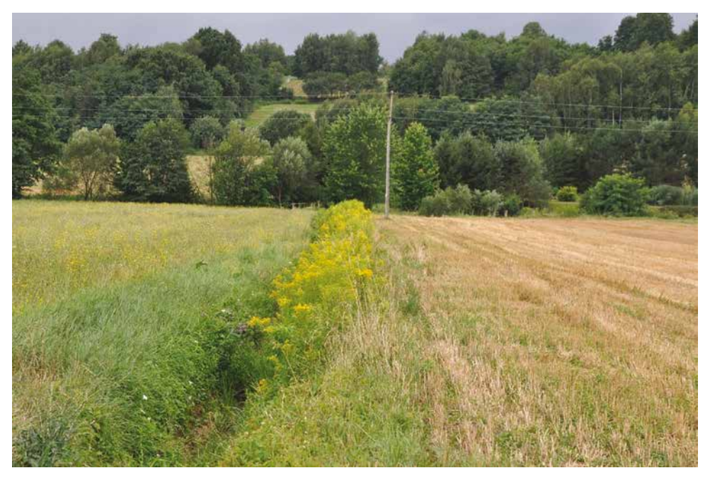
Figure 5: Example of untilled land on the southern slope separating two plots. Some of these also contain bits of forest. Photo: Peter Simonič, July 2019.