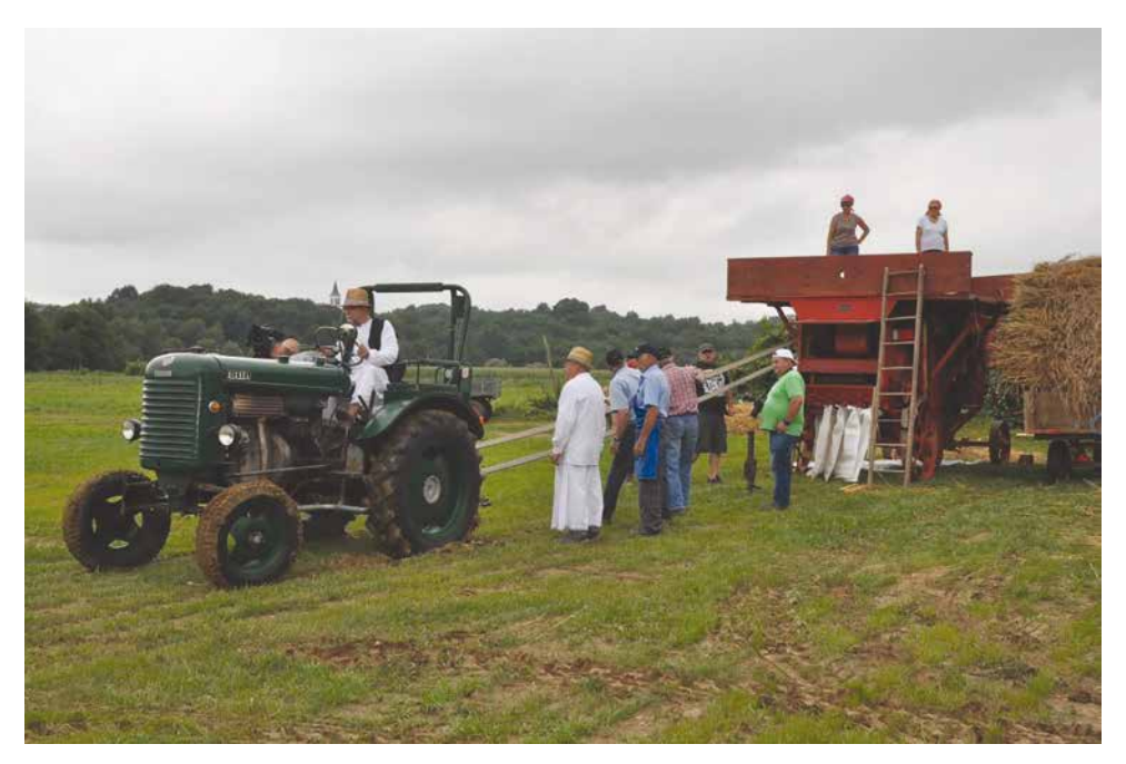
Figure 8: A tractor powering a thresher with a belt pully. Harvest, Dance, and Song Festival in Domanjševci (Sln. Praznik žetje, plesa in petja ), 29 July 2019. Older people stage traditions, and younger people tend the bar.

Figure 7: Domanjševci today. The red line is the border, and the blue line the flow of the Little Krka. The dots indicate today's shared water source at Mali vodnjak (dark blue), shared with Šalovci; the location of nineteenth-century Domanjševci (yellow) and Bükalja (orange); the border crossing with Hungary (dark green), and the nineteenth-century village of Szomoróc (violet); the new Hungarian Self-Governing Ethnic Community Center (light blue); the Lutheran church (light green), and Saint Martin's Church (gray).