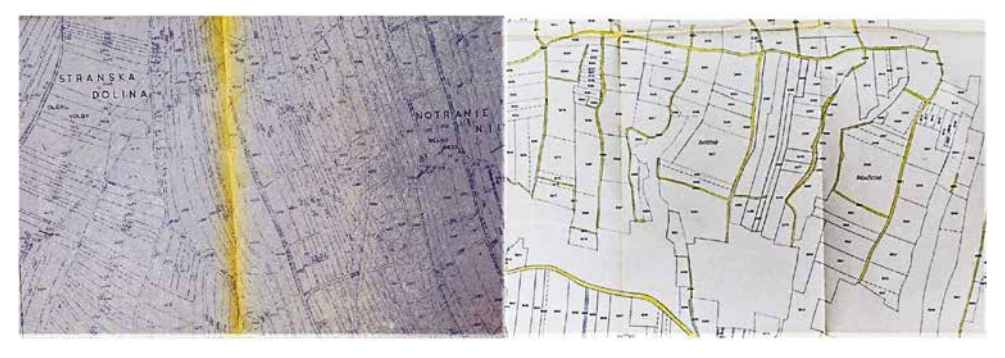
Figure 4: Approximately the same area on the northern slope before and after land consolidation (Left map: Geodetski zavod RS 1992. The yellow strip in the middle is a fold on the archive file in the Murska Sobota Administrative Unit. Right map: Geodetski zavod RS 1993b).