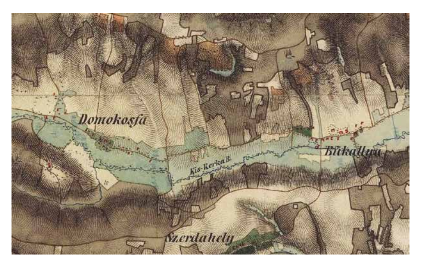
Figure 2: Domanjševci (Hung. Domokosfa ) and Bükalja (Hung. Bükallya ) in the mid-nineteenth century, Second Military Survey, Hungary, 1819–1869 (Mapire).