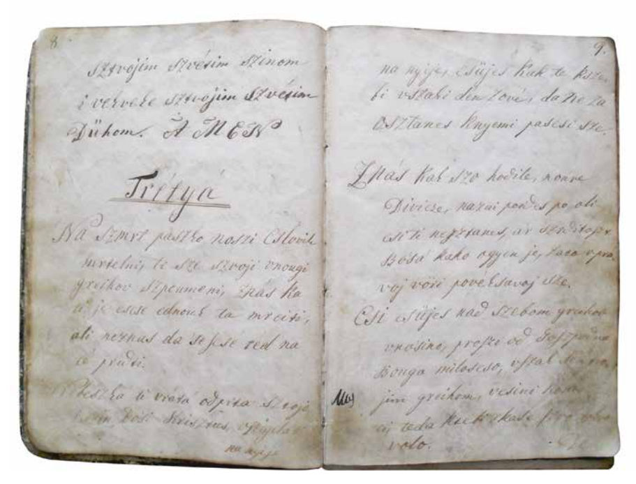
Figure 1. Text from the local manuscript Cantiones Ritkaróczeinsis (1858).