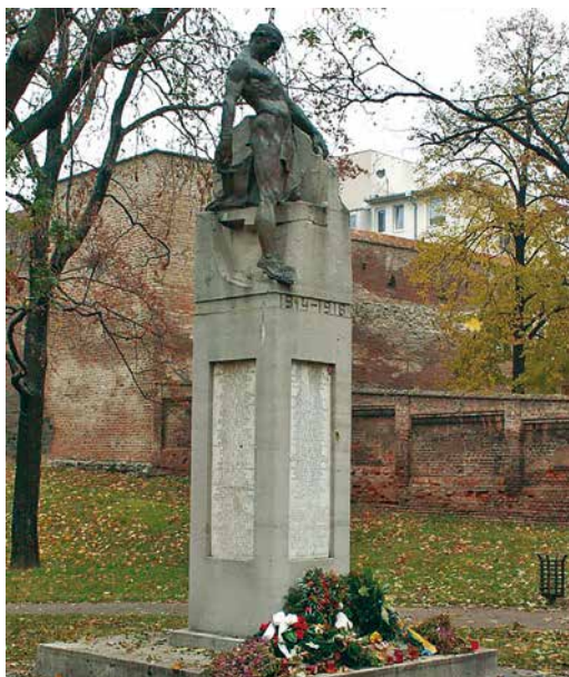
Figures 1 and 2: Bronze First World War memorial in Trnava

1. Photo by Peter Zelizňák; Access: https://commons.wikimedia.org/wiki/File:Trnava_pamatnik_padlym_v_prvej_svetovej_vojne.jpg