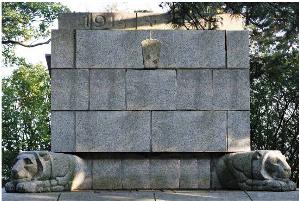
Figure 3: Monument on Murmann Hill

3. Photo by Peter Zelizňák. Access: https://sk.wikipedia.org/wiki/Pomn%C3%ADk_padl%C3%BDm_v_1._svetovej_vojne#/media/File:Bratislava_ulica_francuzskych_partizanov.jpg