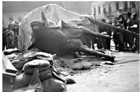
Figure 3: a) Meštrović's statue of King Alexander in Cetinje; b) Destruction of Meštrović's statue of King Alexander.