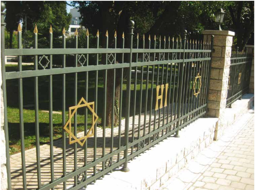
Figure 8: King Nicholas Park in Podgorica. HI stands for Nicholas I in Cyrillic, and the eight-pointed star is an Azerbaijani symbol.