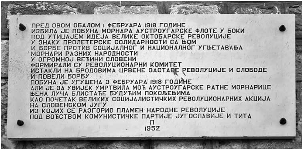
Figure 5: Plaque in Djenovići to revolutionary sailors.