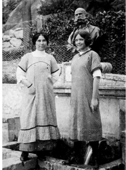
Figure 1: Bust of Franz Joseph in Sutomore.

A less poetic monument stands in Podgorica, in a park that overlooks the Morača River. It simply reads in a dry and factual tone: "Ljubo Jevtić, a volunteer from Srebrenica, Bosnia, shot by the enemy September 16th, 1916." The small plaque honors only the man and not the politics of the war or its aftermath.