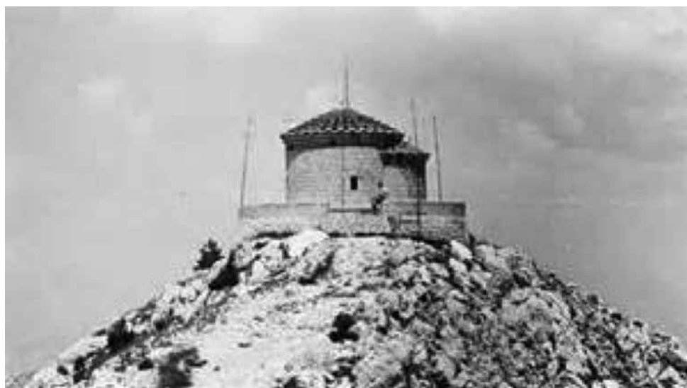
Figure 4: a) Njegoš's chapel destroyed by an Austrian shell; b) Alexander's chapel of Njegoš.