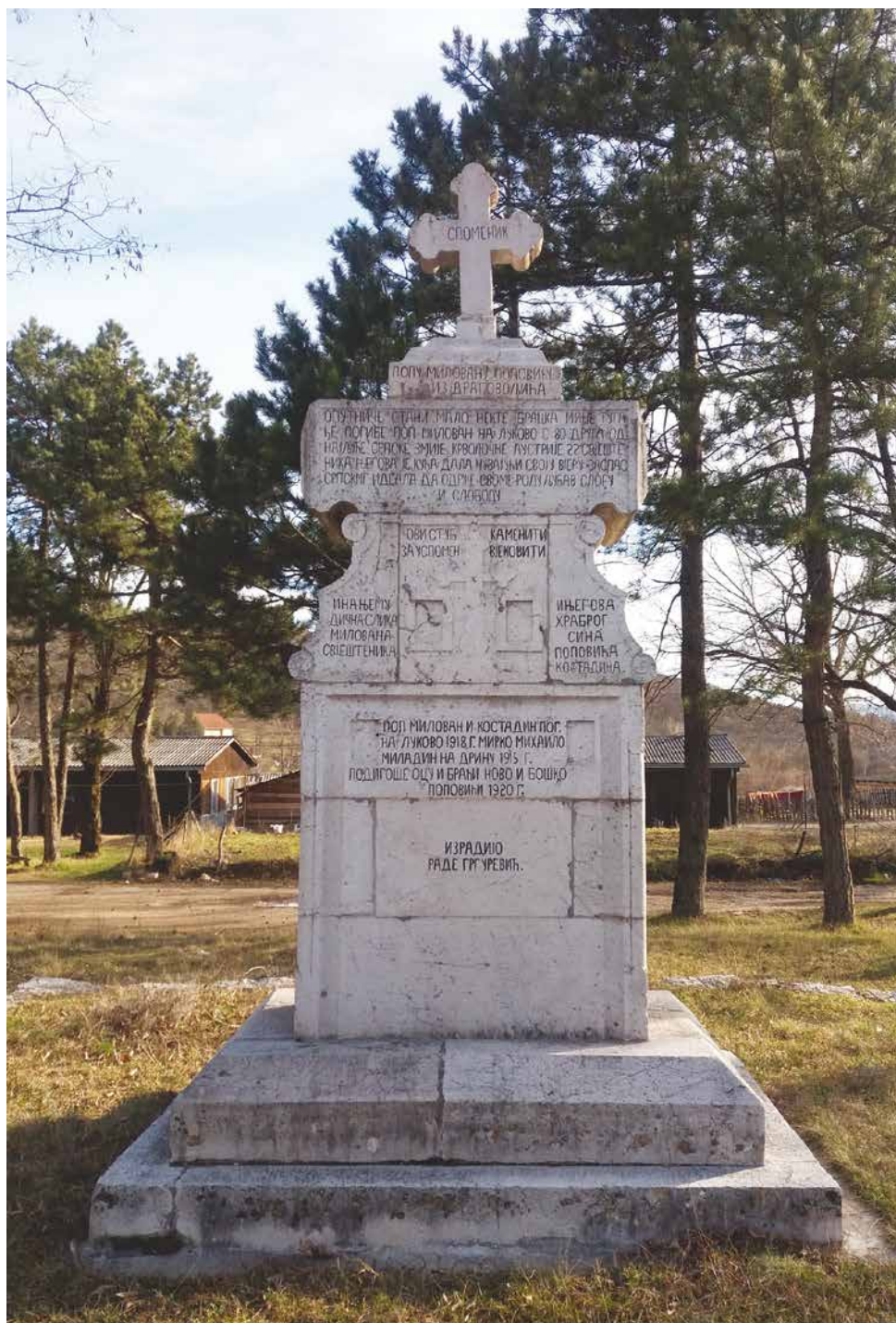
Figure 2: Monument to the priest Milovan Popović in Nikšić.