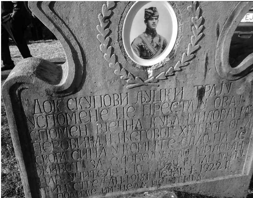
Figure 6: Gravestone in Bare Šumanovića.