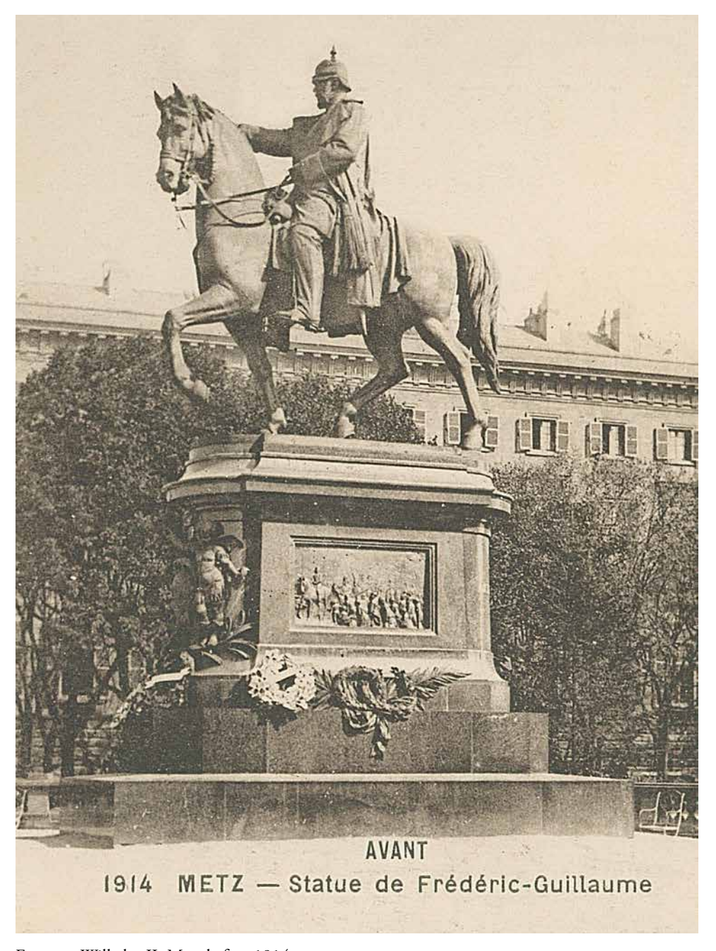
Emperor Wilhelm II. Metz before 1914.