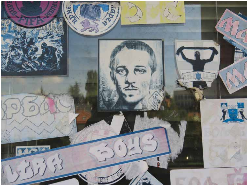
Figure 5: Sticker. Beograd 2016.