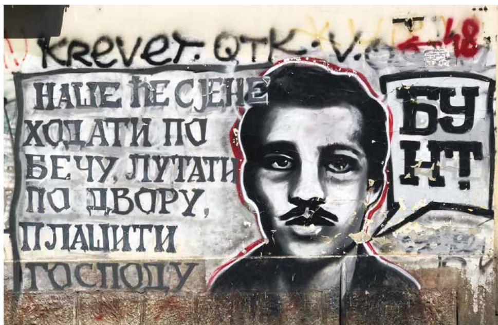
Figure 7: Mural in Belgrade. 2018.