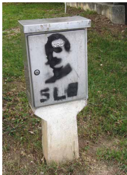
Figure 2 and 3: Stencils in Celje (2011) and Ljubljana (2013).