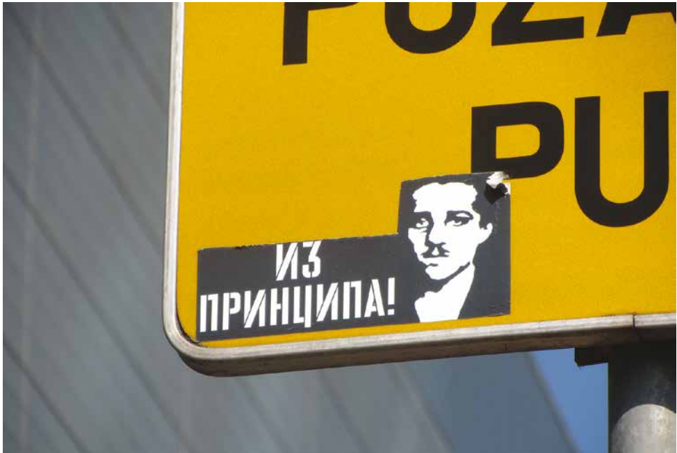
Figure 4: Sticker. Beograd 2014.