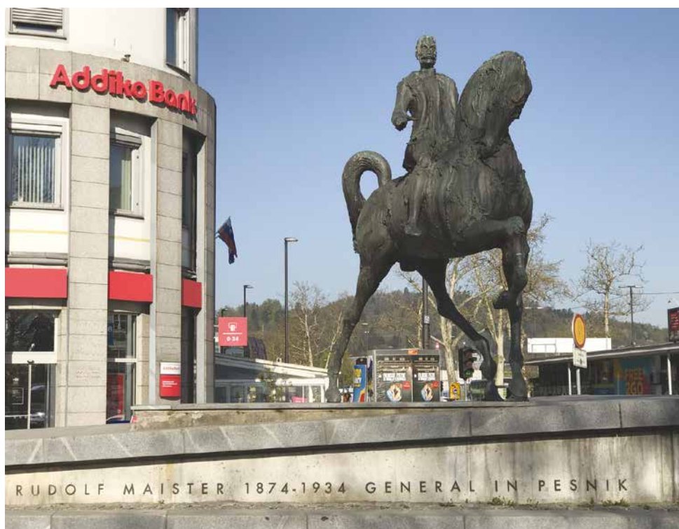
Figure 1: The Maister's monument in front of Ljubljana's bus and railways station. 2018.