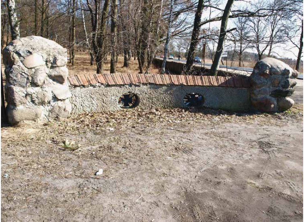
Figures 1 and 2: War cemetery – 1914, Gadka Stara. 2012.