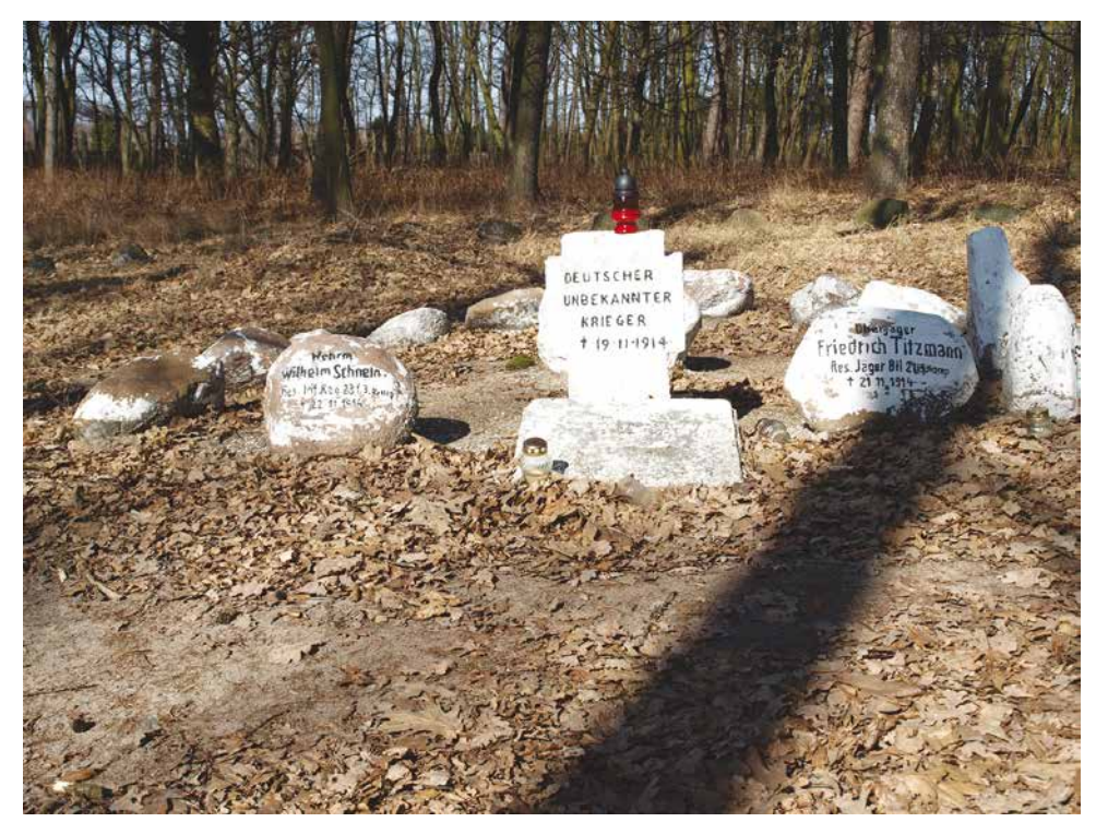
Figure 5: War cemetery – 1914, Gadka Stara. 2012.