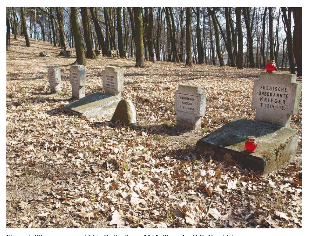
Figure 4: War cemetery – 1914, Gadka Stara. 2012.