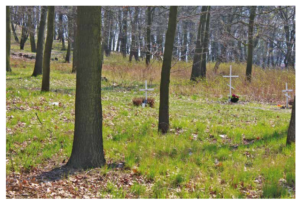
Figure 3: War cemetery – 1914, Gadka Stara. 2016.