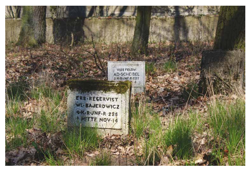
Figure 6: War cemetery – 1914, Gadka Stara. 2016.