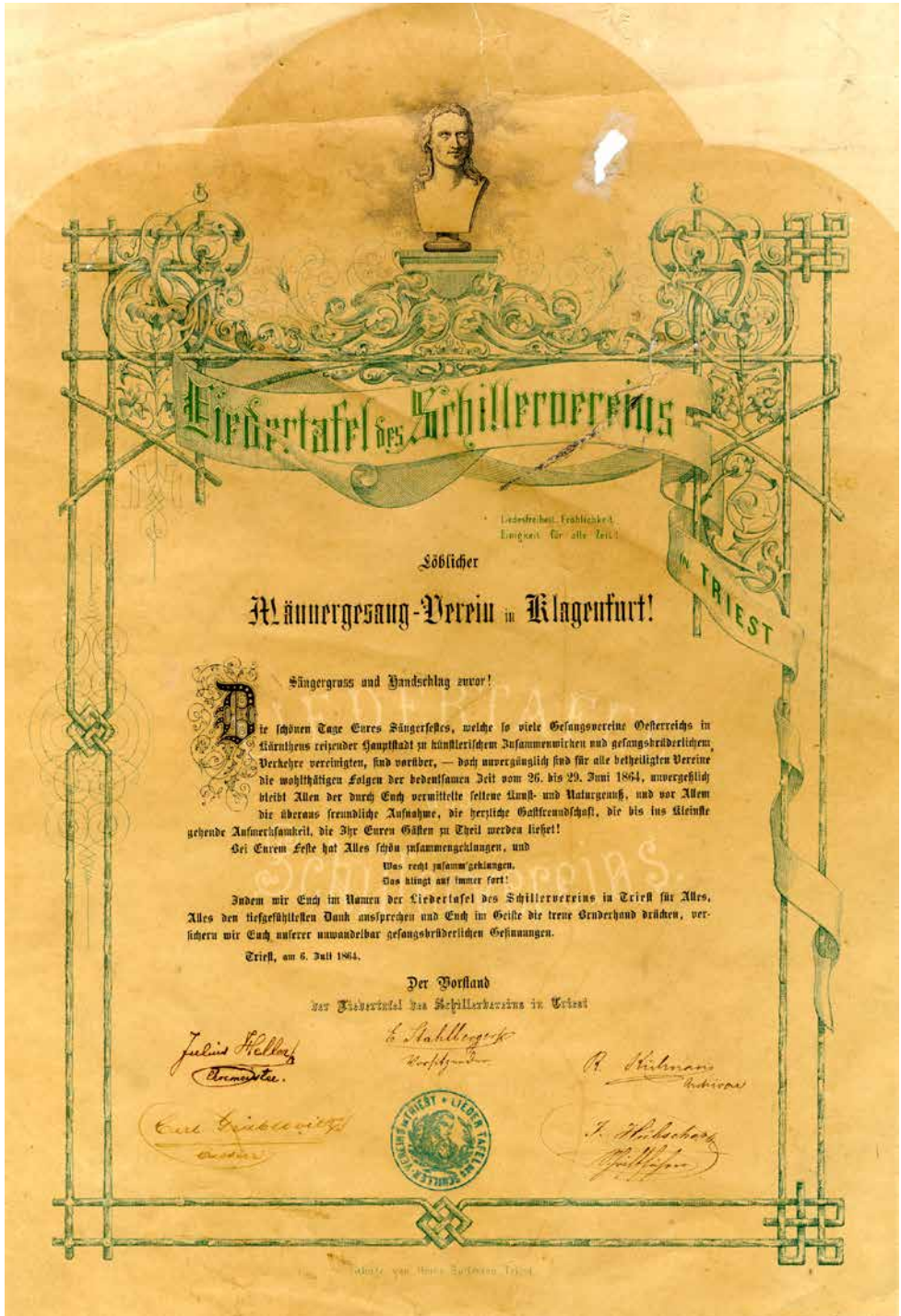
Figure 3: Certificate of gratitude from the Triester Liedertafel for participation in the singing festival in Klagenfurt from June 26th to 29th, 1864