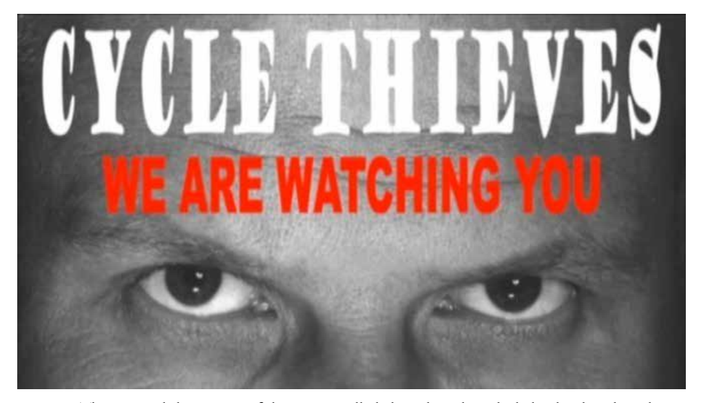
Image 1: The text and the picture of the eyes installed above bicycle racks helped reduce bicycle thefts by 62 percent (source: Nettle, Nott and Bateson 2012).

Mutual surveillance does not have only negative effects. Numerous studies have shown that the feeling of being watched can be crucial in changing habits and in encouraging behavior that is less selfish and more prosocial (e.g. Bourrat, Baumard and McKay 2011; Westacott 2010; White 2014). Researchers from the British Newcastle University, for example, explored the influence that the feeling of being visible had on bicycle thieves (Nettle, Nott and Bateson 2012). They installed signs at three locations on the University's campus where the highest number of bicycles had gone missing. The signs displayed the text "Cycle thieves, we are watching you" above a picture of a set of eyes (Image 1). The researchers monitored the number of thefts at these locations for a year and they determined that the number of thefts fell by 62 percent, but that it went up by 65 percent at control locations where no warning signs were installed. Such methods of theft prevention are inexpensive and apparently quite effective, as it is not necessary to actually monitor critical locations, e.g. with surveillance cameras or by stationing security guards.