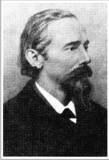
Figure 1: Theodor Gartner, 1843–1925.

The area affected by these events was rather heterogeneous, characterized by different varieties of language and distributed over different political entities. The central area was mainly included in the province of Tyrol belonging to Austria-Hungary (a historically multilingual territory) and had its cultural heartland in some valleys situated between the Dolomites at the borders with the Veneto region (belonging to the Kingdom of Italy since 1866), whereas the surrounding areas represented – according to experts – a sort of transitional zone towards the dialects of northern Italy; this area included the valleys of Nonsberg (Anaunia) and Sulzberg in western Trentino. Outside the borders of the empire, there was the western part of the Ladin area, formed by some Romansch-speaking valleys of the Grison Canton (in the Swiss Confederation), while to the east the broad Ladin-speaking area of Friuli was mainly included in the Kingdom of Italy in 1866; only