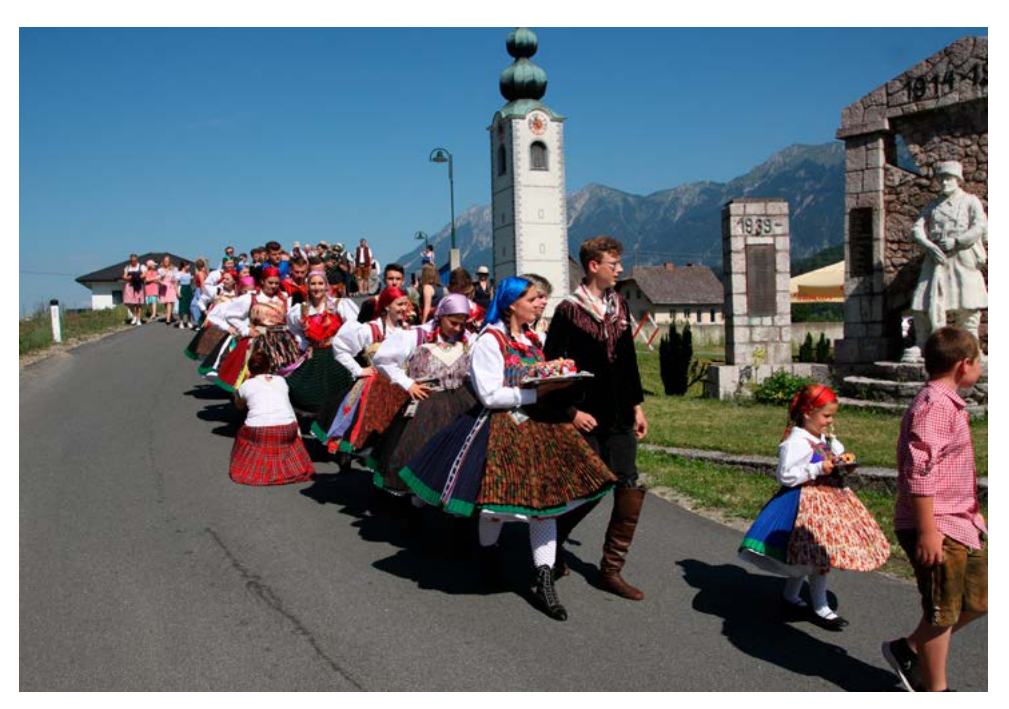
Today, the Gail Valley parish fair denotes the multi-layered identity of the Gail Valley Slovenians, which political and historical milestones have marked. Procession from the church during the parish fair in Vorderberg/Blače, July 3, 2022 (photo by Iztok Vrečko; GNI ZRC SAZU Archive, Ljubljana).

of the song preserved the pre-Christian elements, i.e., euphemisms: Motifs such as the badger and the burrow were replaced by humorous elements that had no ritual background. However, some Slovenian songs sung at the fair were also humorous; among them was the bilingual "Oh, du Diandle fria aufgståndn" (Gašperšič et al., 2014: 281–282), noted down in the 19th century.