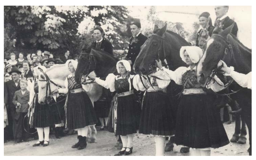
The Carinthian Day in Ljubljana emphasized the importance of the Gail Valley ritual for the Slovenians and the related identification changes. Štehvovci and girls during štehvanje in Ljubljana in 1935 (Photo Šmuc; GNI ZRC SAZU Archive, Ljubljana).