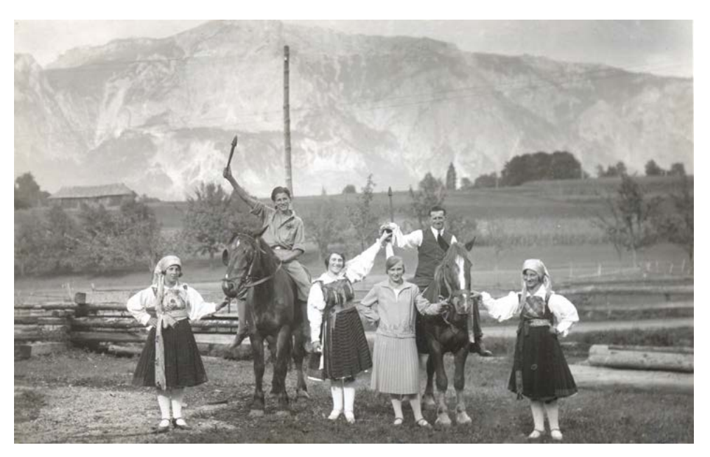
After World War I, the celebration of the Gail Valley parish fair became more prominent regionally. The postcard picture of štehvanje from Draschitz/Drašče from 1931.