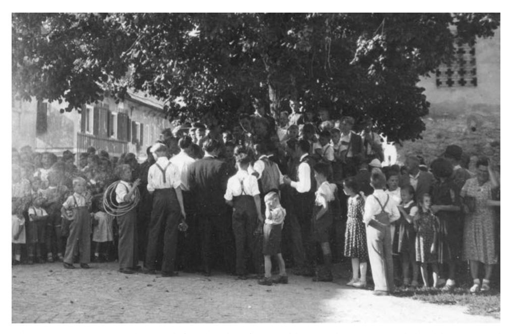
Slovenian songs sung at the parish fair decades after World War II have preserved the old ceremonial roles and expressed revolt against assimilation. Boys singing under the linden tree at the parish fair in Achomitz/Zahomec, August 1, 1951.