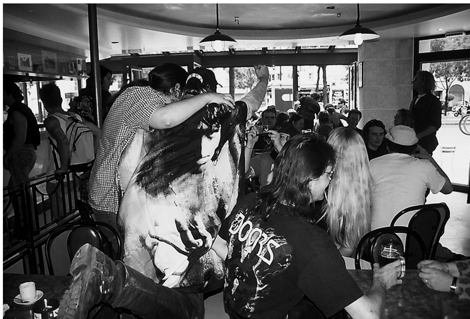
Fig. 2: Morrison-tribe celebrating his dying day in the Café Renaissance, next to the cemetery of Père Lachaise, 3 July 2004.

a well-known meeting point for all Morrison fans. Here they can drink, smoke, sing along with The Doors music, yell, play around, and make new contacts.