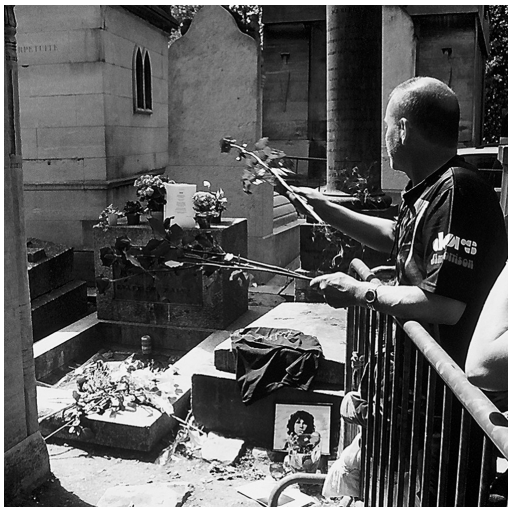
Fig. 5: Offering of roses to Jim Morrison, Père Lachaise cemetery, 10 July 2004.