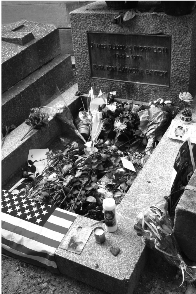
Fig.8: Grave of Jim Morrisons covered with offerings and gifts, Père Lachaise cemetery, 3 July 2005.