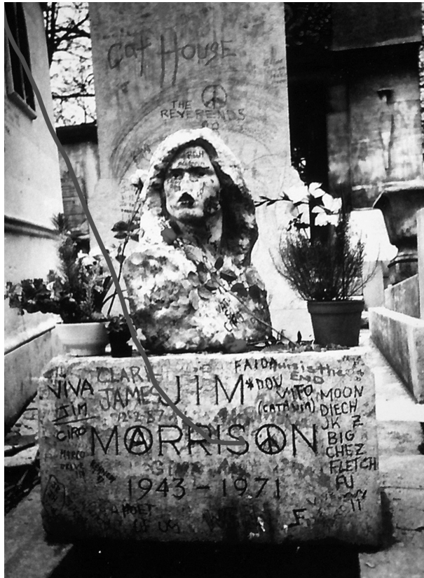
Fig. 4: Postcard of the grave of Jim Morrison as it was at the beginning of the 1980's, with the first headstone and the later stolen bust.