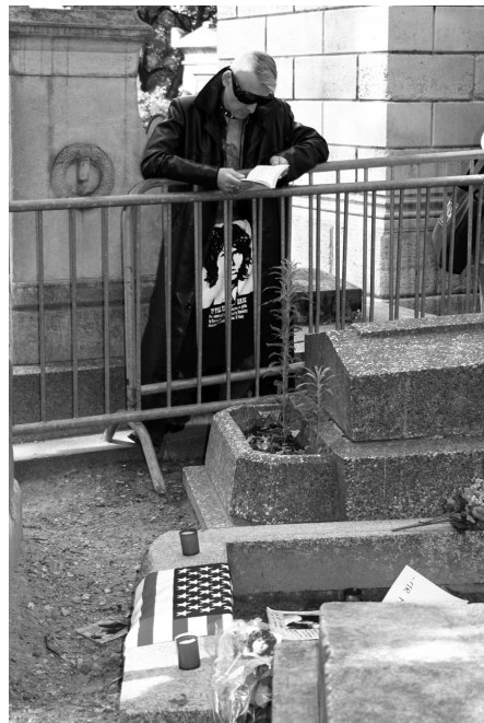
Fig. 6: Reading Jim Morrison's poetry near his grave, 3 July 2005.