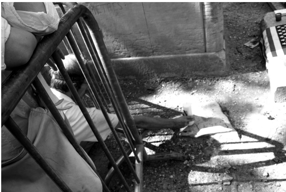
Fig. 7: Placing of candles near Morrisons grave, 3 July 2005.