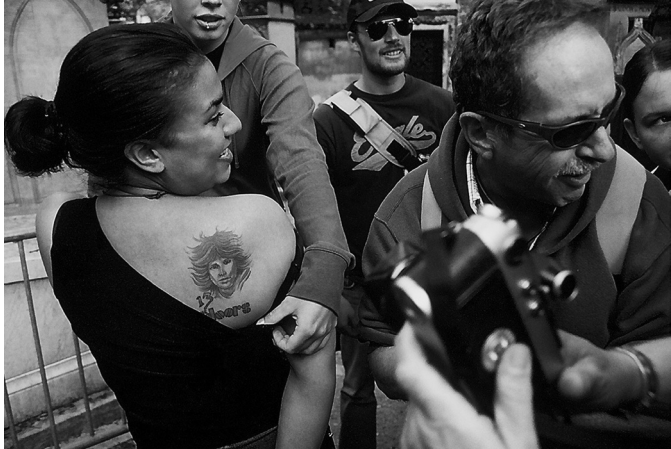
Fig. 3: Morrison bodily inscribed, Père Lachaise cemetery, 3 July 2004.

them – as it was in another way for the social group – it is very important to be in physical contact with the grave: touching, holding, and possibly taking home sand from the grave. Since the arrival of the fences, they at least want to be in visible contact with the grave. With their discrete behavior, they are often still allowed to burn incense and light candles in order to improve the contemplative ambience.