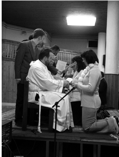
Fig. 4: “The Invitation to Prayer”.

The leaders of the Neocatechumenal Way surely know this and seek to achieve such forms of ritual engagement so that, by participating in them and acquiring new networks of meaning through them, each member can attain a new, sacred identity. Ritual, therefore, is very structured and the use of the body is carefully taught, following the well-known model that the modification of behavior and modification of beliefs go hand in hand [cf. Bowie 2000: 55]. Truly, anthropology has known for a long time that the body, mind, and emotions are