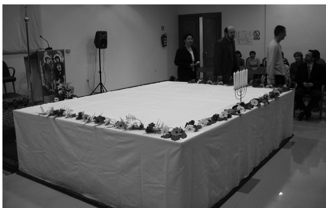
Fig. 3: The altar.

Figure 3 shows how the altar is arranged with flowers to please the sense of sight. A painting by Arguello is also seen on the rostrum and there are flowers beneath it.