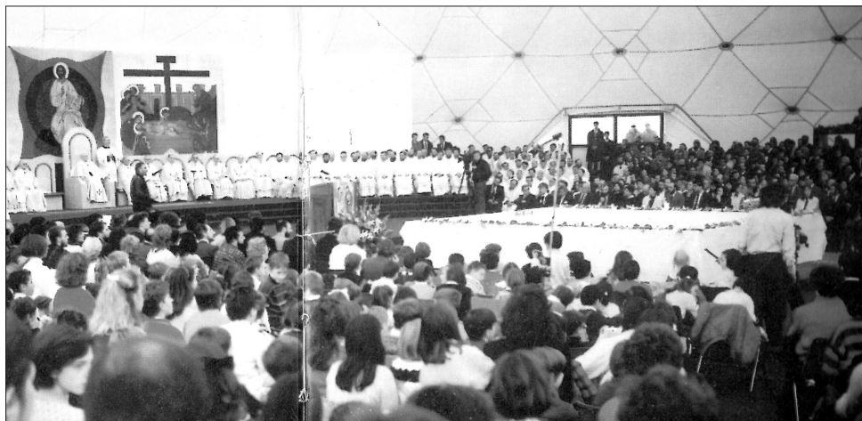
Fig. 2: A Neocatechumenal community celebrating Communion.

many icons of the Orthodox Church (the Eleusa Kykkotissa). [ http://www.geocities.com/elneocatecumenado/sgdafamilia.htm ]