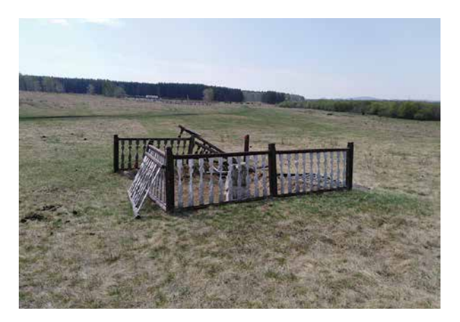
Fig. 4. Akhunovo megalithic complex. Excavation site №3 (photo by A. Tuzbekov, May 2019).

Fig. 3. Akhunovo megalithic complex. Excavation site №2 (photo by A. Tuzbekov, May 2019).