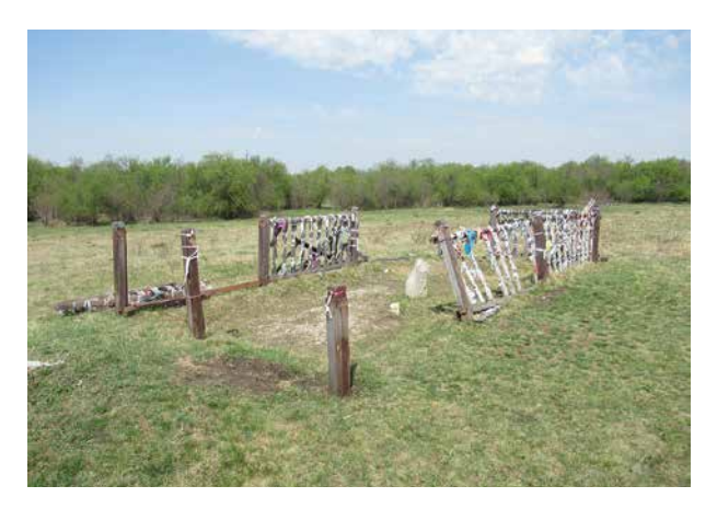
Fig. 3. Akhunovo megalithic complex. Excavation site №2 (photo by A. Tuzbekov, May 2019).

Fig. 2. Akhunovo megalithic complex. Excavation site №1 (photo by A. Tuzbekov, May 2019).