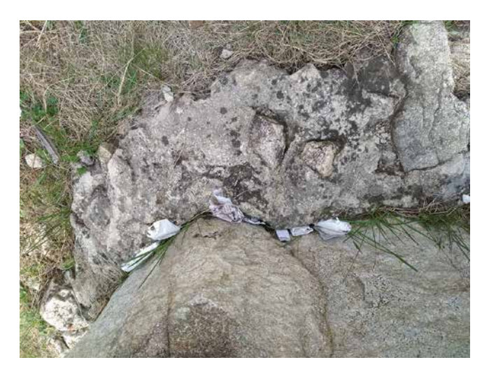
Fig. 7. Notes at the foot of the Menhir № 13 (photo by A. Tuzbekov, May 2019).