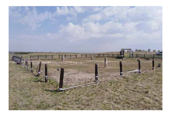
Fig. 2. Akhunovo megalithic complex. Excavation site №1 (photo by A. Tuzbekov, May 2019).