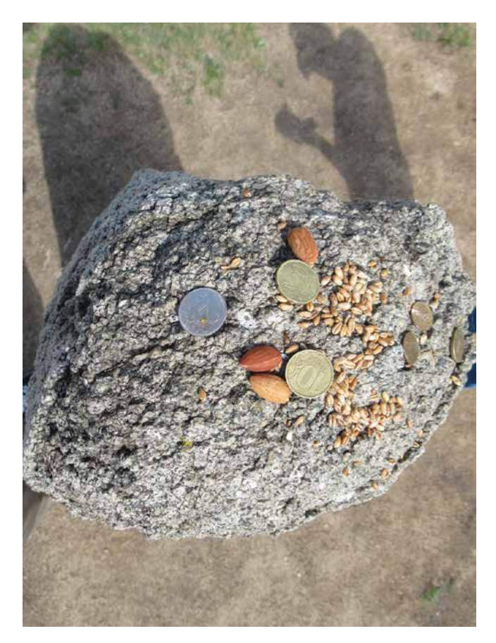
Fig. 6. Top of the Menhir № 1 (photo by A. Tuzbekov, May 2019).