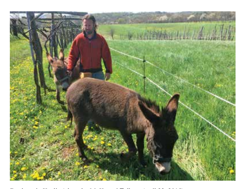
Donkeys in Kazlje

This description clearly reflects the typical attitude of the Istrian population towards the donkey, which in the spirit of the times was unkind. Even worse was the manner in which the animal was handled. Erjavec adds that the one who is to blame for the donkey's moodiness, stubbornness, and proneness to biting and to stamping its hind legs is man himself, for people had been beating and oppressing donkeys for centuries, and had no sympathy for them. Since donkey's senses are much keener than those of the horse the donkey can quickly sense danger, and promptly stops. Yet instead of trying to understand this behaviour and pausing for a moment, the animal was usually promptly beaten.