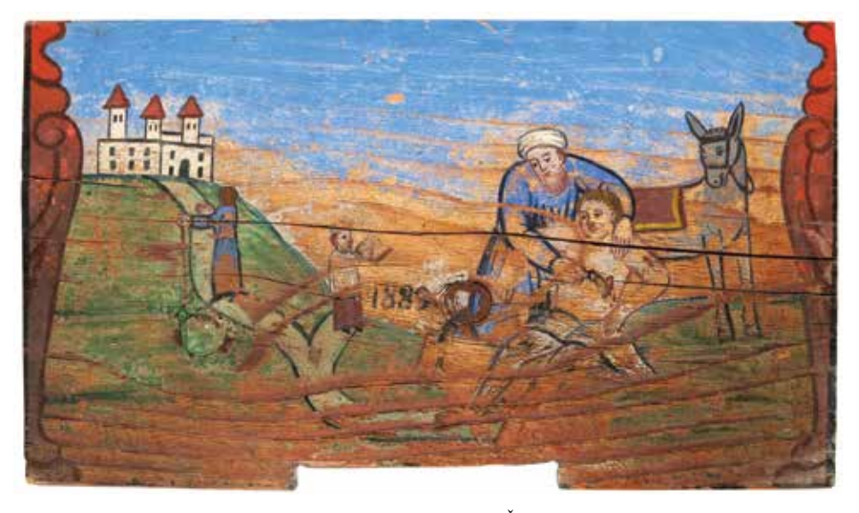
The Good Samaritan, 1883, beehive panel (Makarovič, Rogelj Škafar 2000: no. 14) Slovene Ethnographic Musum in Ljubljana