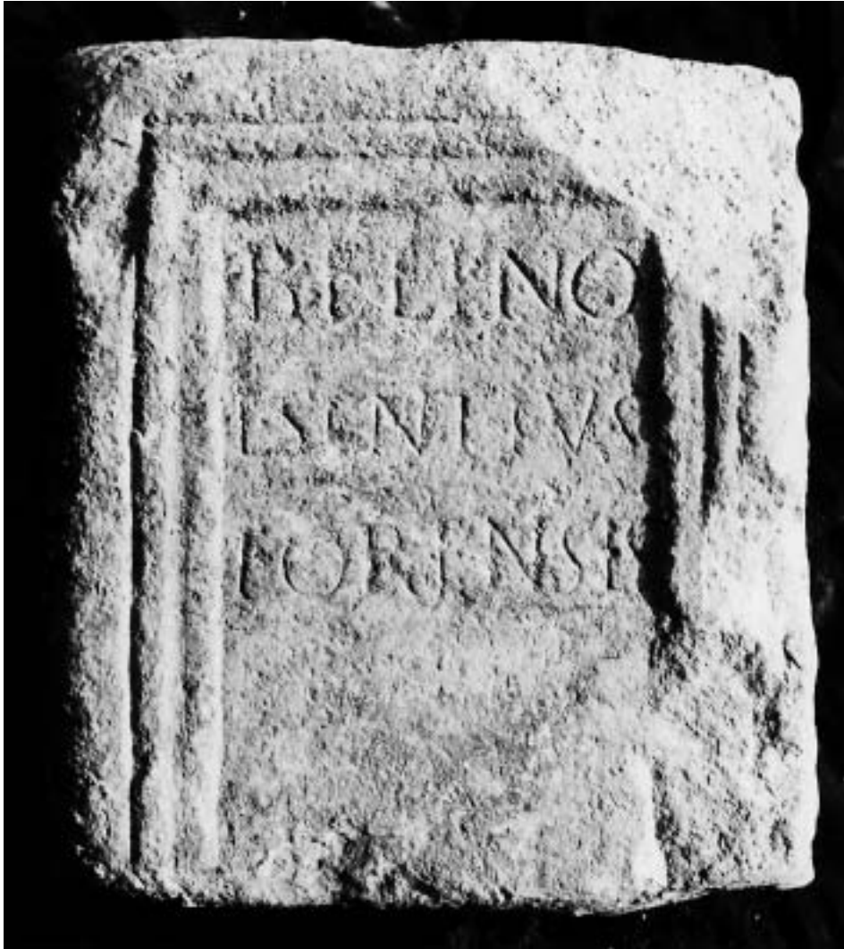
Fig. 2: The only altar of Belinus discovered in Slovenia, in Celeia (M. Lovenjak, Arh. vest. forthcoming).

habit in provinces, even in Noricum, whose contacts with Italy go back to the 2nd century BC. It is significant that as late an author as Tertullian (3rd century AD) claimed that Belenus was the god of the Noricans, although by his time the divinity was at the height of his fame in Aquileia, as the defender of the city, who saved it from the besiegement by the soldiers of Maximinus Thrax. Belenus must have been widely known as the main divinity of the town, which increasingly developed as one of the most important cities of the Empire.