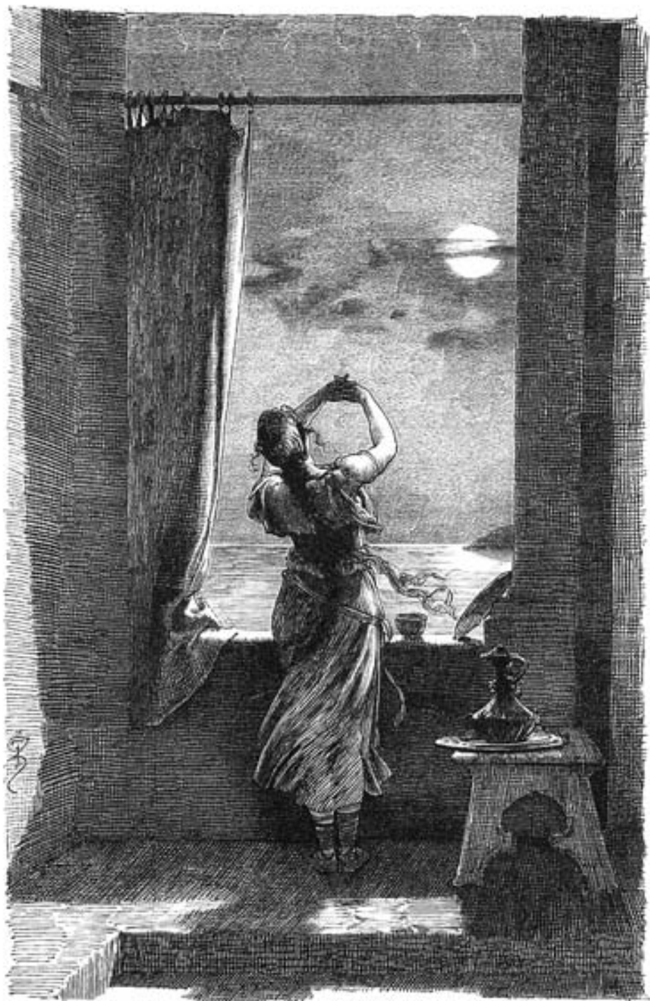
Fair Vida. In: Die Österreichisch-ungarische Monarchie im Wort und Bild V, Wien 1891.