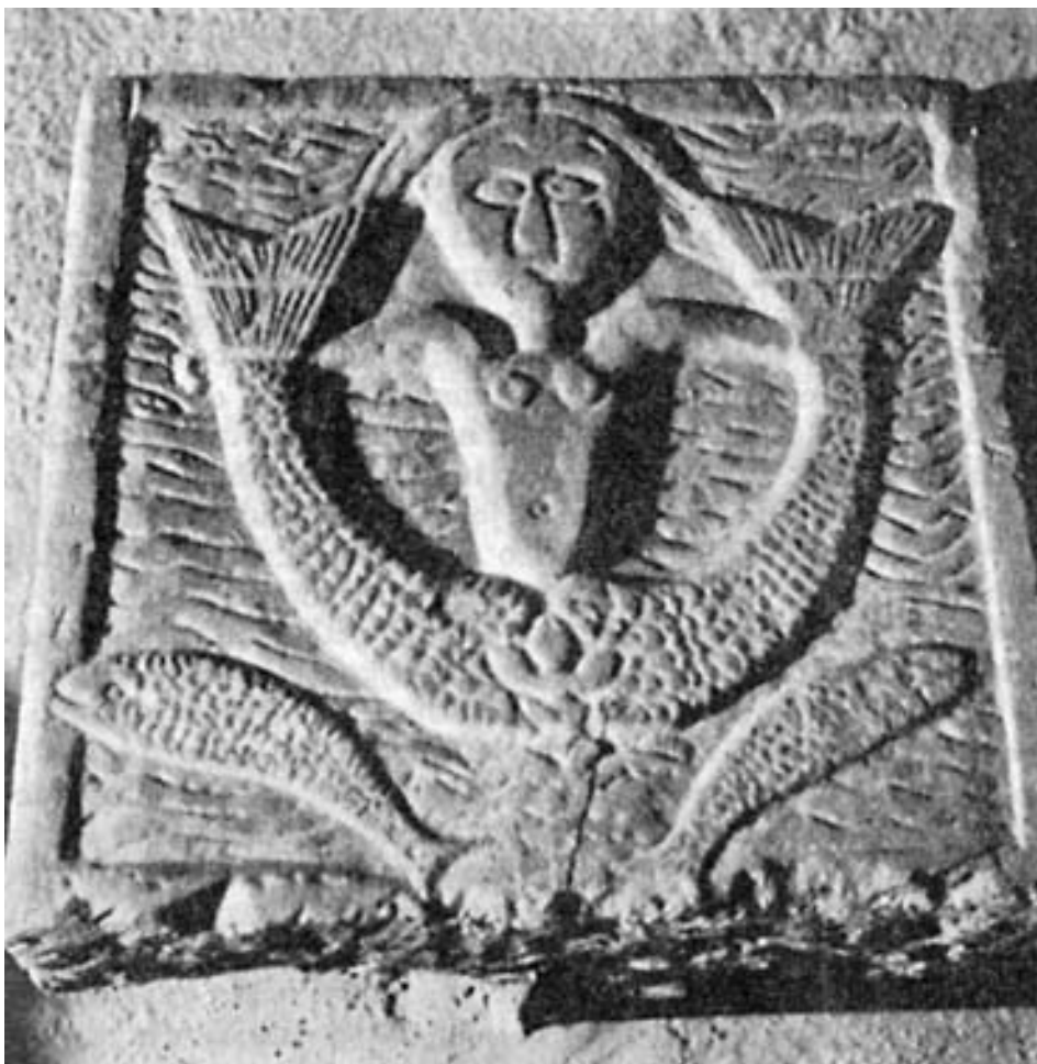
Faronika the Fish, relief from Čedad / Cividale, Italy, 8th century.

According to some folk tales the earth did not just remain floating on water, but was stuck on a fish or a water snake. Slovenes still have a tradition that says that a huge fish carries the earth on its back. When the fish moves, an earthquake occurs. When it dives into the water, this causes the end of the world. The same is quoted in the folk song about Faronika the fish in which Jesus asks the fish not to swing its tail or turn onto its back lest the world be sunk or doomed: 3