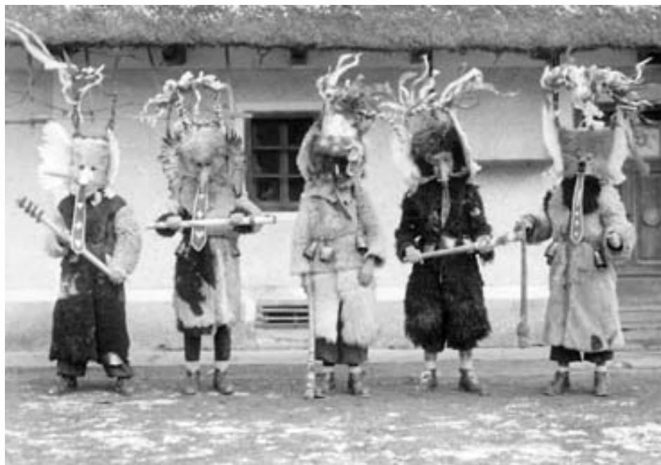
Kurents from Markovci in Styria