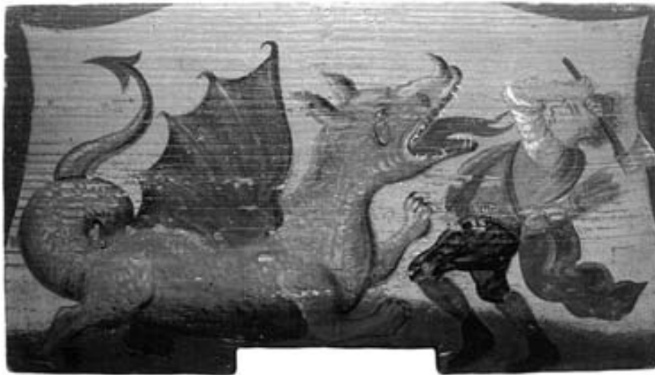
The hero fights the dragon, the beehive painting (Slovenian Ethnographical Museum in Ljubljana)

As Perun defeated Veles, the Zeleni Jurij, sometimes named Jurij, Jarilo or Vesnik, conquers his enemy Rabolj in a duel; Slovene folk customs have preserved the memory of this fight. 17 In Slovene folk songs a hero saves the girl Marjetica. In the song »Trdoglav and Marjetica« (Trdoglav in Marjetica SNP I, 21) a prince saves a girl kept captive in Trdoglav's desolate castle; Trdoglav here personifies the devil. In these songs or narratives the hero defeats his opponent in a duel, or escapes with the girl on his horse, managing to elude his pursuers by using magic objects or by demanding something impossible from the girl's abductor.