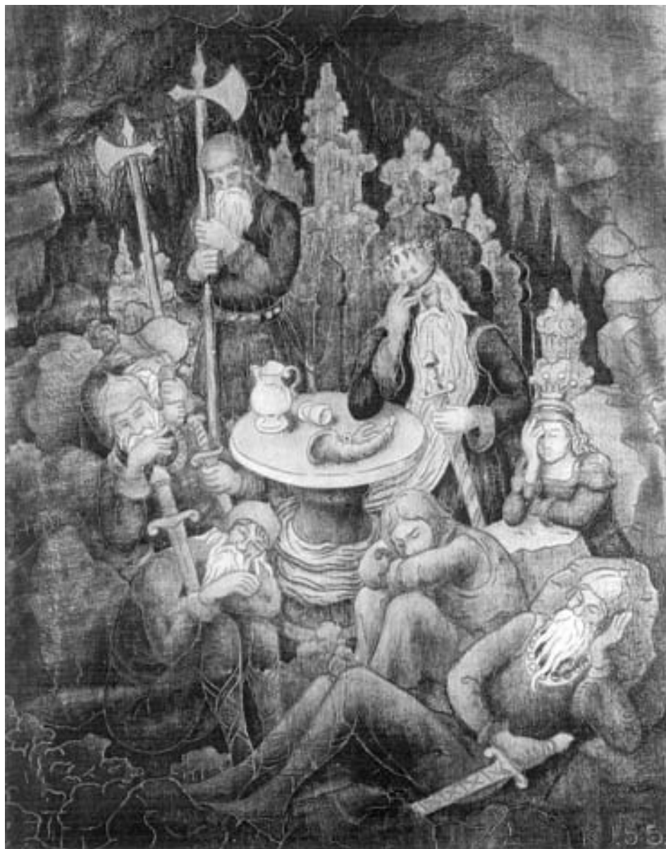
King Matthias. In: Die Österreichisch-ungarische Monarchie im Wort und Bild V, Wien 1891.

The image of King Matthias combines mythical as well as epic heritage. 60 In the 19 th century this personality was incorporated into literature as a mythical symbol of national and social ideas. J. Komorovsky is of the opinion that due to unfavorable circumstances af-