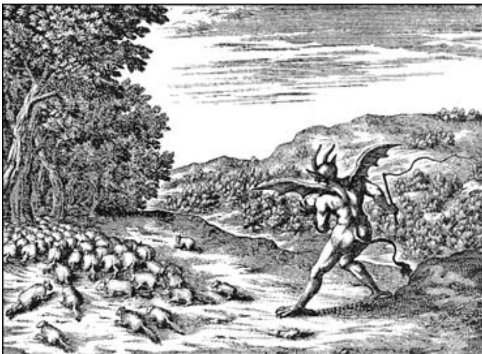
Shepherd the devil, in: Johann W. Valvasor, Die Ehre des Herzogthums Krain , Laibach-Nürnberg 1689.

St. Nicholas and St. Basilius. In the role of the protector of herds and medicine he was identified as St. Blas. 39