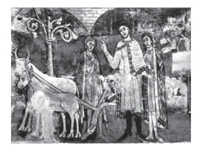
Přemysl the Ploughman, a fore-father of the Czech family of the Přemysls, a fresco from St. Katherine's rotunda in Znojmo, beginning of the 12th century (http://www.znojemskarotunda.com/ikonsamo.htm)

gious function of a plough could have been actualized in annual or protective rituals, then the sacred ruler or his plenipotentiaries would come back to repeat the ploughing).