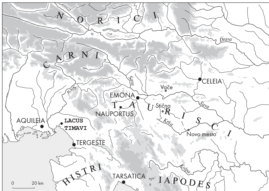
Fig. 1: Map showing peoples and places mentioned in the text (computer graphics: Mateja Belak).

Veneti. It was first mentioned by Strabo as a village belonging to the Carni; 5 it may have been situated on the territory of the Histri earlier. The Veneti played important economic, and consequently political and cultural roles even outside their territory in northeastern Italy, as is proven most of all by the 'Venetic' inscriptions found in present-day Austrian Carinthia and Slovenia, in particular in the Soča/Isonzo valley, where Tolmin and somewhat later Most na Soči (Sv. Lucija/Santa Lucia) must have been two of the significant pre-historic settlements of a population closely related to the Veneti (Fig. 1). 6 These tribes had close contacts with northeastern Italy, southern Carinthia, and the Bohinj region. 7 The Veneti must have influenced more or less the entire northern Adriatic and eastern Alpine areas, and it is not surprising that, according to Ammianus Marcellinus, the Julian Alps were called Venetic before the Augustan conquest ( quas Venetas appellabat antiquitas ). 8