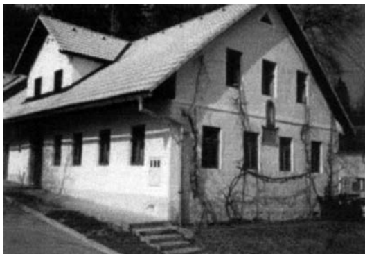
Jernej Kopitar (by Savo Sovre) and the house in Repnje near Ljubljana in which Jernej (Bartholomäus) Kopitar was born.