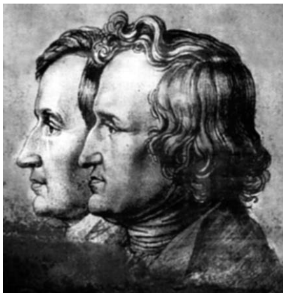
Jacob Ludwig Carl Grimm (Hanau, January 4, 1785–Berlin, September 20, 1863) and Wilhelm Carl Grimm (Hanau, February 24, 1786–Berlin, December, 16., 1859)

Karadžić 12 but he himself had not personally met Grimm in Vienna until 1815 (Glonar 1938: 134).