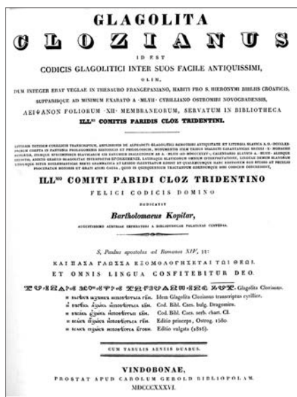
Bartholomaeus Kopitar, Glagolita Clozianus (Vienna 1836)

research of the Albanian language, the Romanian dialect of the Vlachs; Bulgarian and Celtic languages; and the language spoken in Brittany (Vasmer 1938: 15-16). They also discussed Kopitar’s “Pannonian theory” about the origin of Old Church Slavonic.