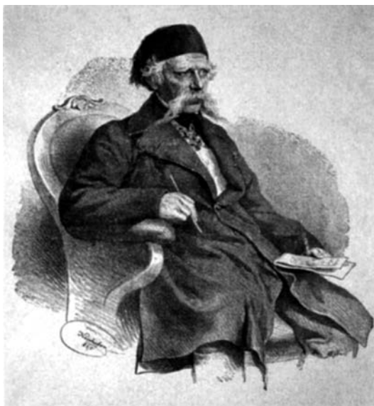
Vuk Stefanović Karadžić (Tršić, October 26, 1787 – Vienna, January 26, 1864)

In 1813, he had joined the leaders of the Serbian uprising who were fleeing the Ottoman Empire's repeated assault on Serbia, and arrived in Vienna. He met Kopitar in December of that year. 10 Very impressed by his extraordinary intelligence and kind manners, Kopitar became Karadžić's most loyal friend, teacher, consultant, and patron. He perceived Karadžić as the figure who could end the anarchy in the Serbian literary language and lay the foundations of spelling and literature. Wasting no time, he wrote about Karadžić in a letter sent that very month to Jacob Grimm , a prominent German philologist. This was also the period in which Grimm started his diplomatic career. After Napoleon's defeat in 1814, Grimm arrived to attend the Congress of Vienna. But Kopitar departed for Paris on July 11, 1814 in order to arrange the return of the books, manuscripts, and other valuables Napoleon had taken from Vienna, and before returning to Vienna on February 14, also visited London and Oxford. Although in Paris at that time, 11 Kopitar was able to establish contacts between Grimm and