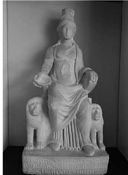
Fig 6: Cybele with lions, Istanbul Archaeological Museum 3rd century A.D. (Source: https://www.trtworld.com/turkey/ancient-cybele-statue-returns-to-turkey-42327/ ; Photos’ property: Istanbul Archaeological Museum).

Interestingly, Meskell, who calls herself a feminist, critiques Gimbutas’s theories, moving from the generic “pure fantasy” (Meskell 1995: 83) to “political”, “reverse sexism”, “gynocentric agenda”, and “gynocentric narratives” (Meskell 1995: 83, 76, 84). Moreover, the archaeologist, considered one of the most important exponents of post-processualism, was part of Ian Hodder’s working group at the Çatalhöyük site, unconditionally supporting his interpretations.