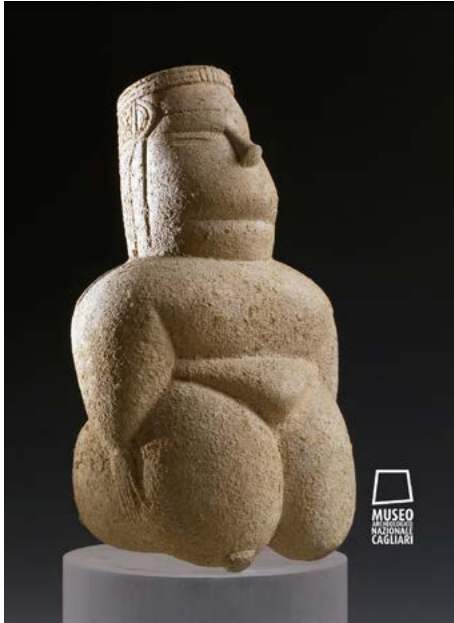
Fig. 3: Limestone female figurine from the necropolis of Cuccuru S'Arriu, Sardinia, front view. Bonuighinu culture, 4800-4450 B.C. Cagliari, Museo Archeologico Nazionale.