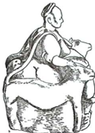
Fig. 2: Reconstructed drawing after Mellaart (1967: 138).