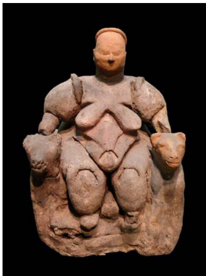
Fig. 1: Mellaart's Goddess with leopards. The figurine is currently located at the archeological museum of Ankara.

According to Mellaart, at the site there used to exist a city devoted to the cult of the Mother Goddess. Several years later, archaeologist Marija Gimbutas not only confirmed Mellaart's hypothesis, but she also conducted multidisciplinary research of female figurines and related symbols. Gimbutas affirmed that during the Neolithic period, in the “Old Europe”, there existed a cult of numerous Goddesses (or alternatively, of one single Great Goddess, presented in many forms). Her theories have generated strong reactions in academia, both positive and negative, especially within the field of archeology.