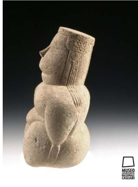
Fig. 4: Limestone female figurine from the necropolis of Cuccuru S'Arriu, Sardinia, side view. Bonuighinu culture, 4800-4450 B.C. Cagliari, Museo Archeologico Nazionale.