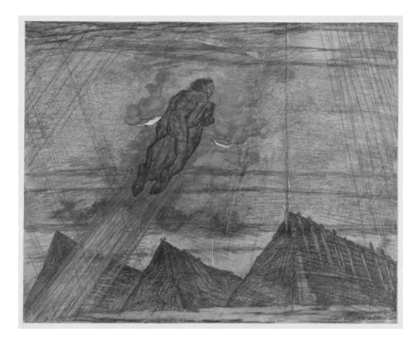
Fig 6. Kratt-bearer, Kristjan Raud, 1927. Vikipeedia.

The Livonian witches can be invisible when they are sucking milk from a cow, while their shadow can be seen on the barn wall. Loorits gives an example where the storyteller's mother understood that somebody had been sucking on her cow every night. One morning, she went to milk it and on the wall saw a naked man with big balls, which were decreasing: then there was a flash like a flame