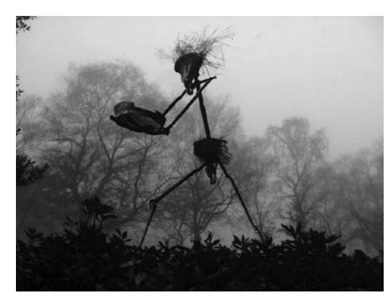
Fig. 2. Kratt in the 2017 fantasy drama film November by Rainer Sarnet.

the master and the mythical helper is complex. Magical helpers may appear upon reading the Seventh Book of Moses or the Black Book<sup>4</sup>, an ancient religious complex in itself, a famous book of knowledge and power (Eisen 1896; Ljungström 2015; Klintberg 2010: M 85, type P 41-43); Davies 2010; Kõiva 2011a). The self-made creature refers to a complex of witches possessing supernatural knowledge. The tradition of kratt has several parallels with the spiritus, especially legends about difficulties of doing away with a spiritus or kratt.