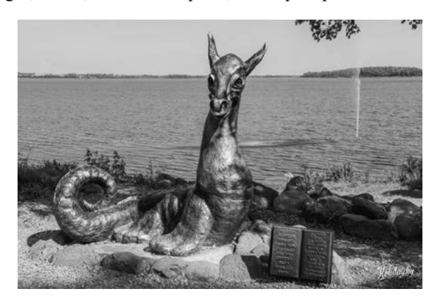
Fig. 5. Tsmok. Monument in Lelepe, Belorus.

features of both zoomorphic and anthropomorphic creatures. Ukrainian folklore also includes stories of serpents that walk instead of fly (Levkiyevskaya 2019: 439, No. 9). Some remarkable features are attributed to the flying serpents as they appear in flight, emphasising their fiery, luminous nature. Certain changes can be noticed in descriptions of the serpent's colour, the brightness of its glow, and its shape based on the way it flies and what it is carrying.