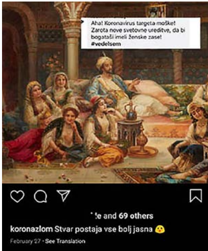
Image 5: [Aha! The corona virus is targeting men! A conspiracy of the new world order so that all rich men can have all the women for themselves]

form cannot function if the semantic referent is not understood widely. This means that while we can say that conspiracy stories are nevertheless narratives of a disaster, just the opposite, humour proves its importance in the contemporary narrating situation.