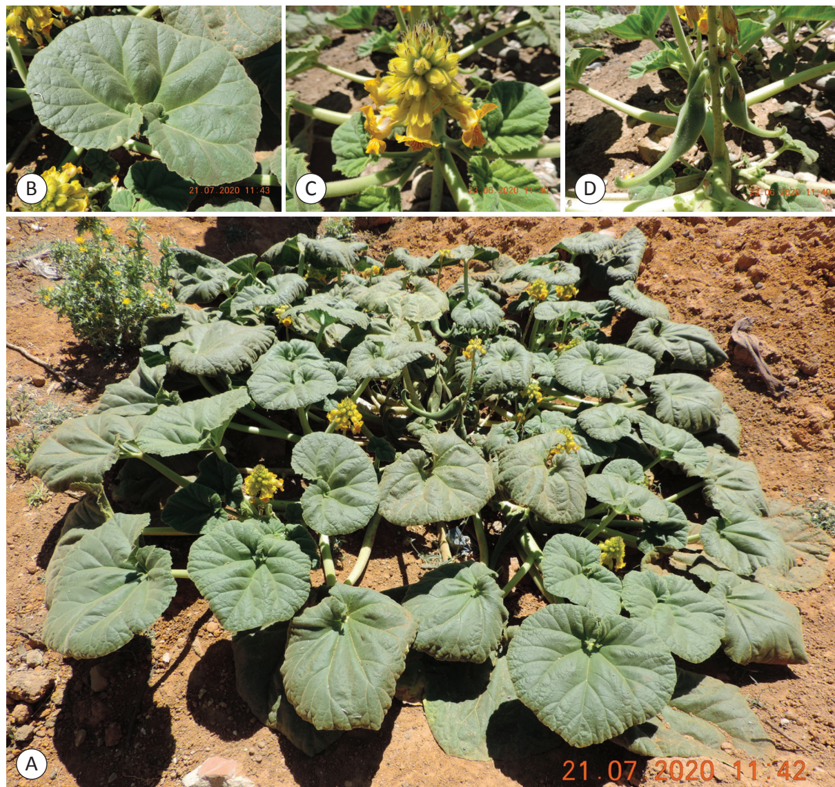
Figure 1: Ibicella lutea in Tunisia. A: habit of the plant in its habitat; B: detail of leaf; C: inflorescence with numerous flowers showing free sepals and yellow corolla; D: typical shape fruits which terminate in an upwardly-curved beak (Jendouba, NW Tunisia; 23.6.2020 and 21.7.2020).

Slika 1: Ibicella lutea v Tuniziji. A: rastline na rastišču; B: detajl lista; C: socvetje s številnimi cvetovi, ki prikazujejo proste čašne liste in rumene venčne liste; D: značilno navzgor ukrivljeni plodovi (Jendouba, SZ Tunizija; 23.6.2020 in 21.7.2020).