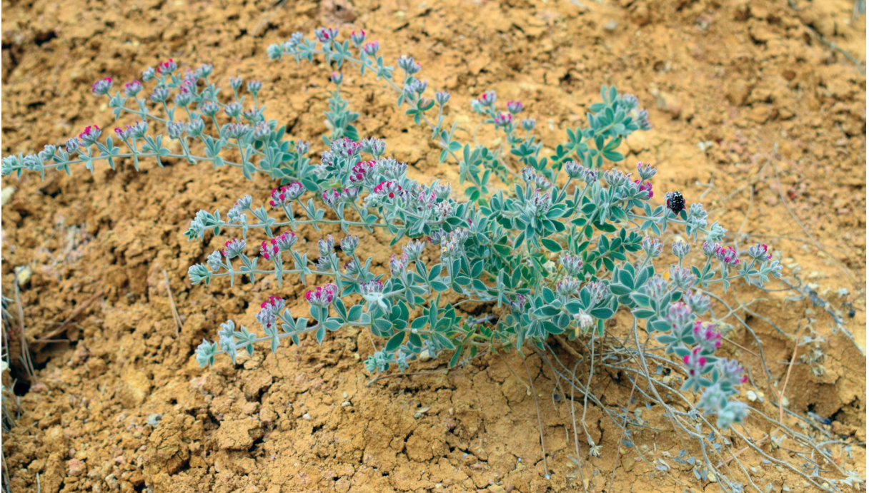
Figure 1: General appearance of Lotus sanguineus in Kölese location. Slika 1: Vrsta Lotus sanguineus na lokaciji Kölese.

Subcaespitose perennial herbaceous plants, woody at base. Stem up to 20–40 cm, soft, white-villous hairy. Leaves with 5-leaflets, rachis 1–4 mm long; leaflets 5-20 \times 3-10 mm, oblong-obovate to oblong, both sides densely villous, mucronate at apex, old leaflets sometimes nearly violent. Inflorescence umbellate 4–8-flowered. Peduncles 0.5–2 cm long; involucral bracts are equal to the number of flowers, lanceolate, 2.5–4 mm long, green. Flowers sessile or subsessile, pedicels up to 1mm. Calyx ± curved, slightly gibbose at base, 5 mm long, white-hairy, lobes narrowly triangular-lanceolate, slightly longer than calyx tube, purple at apex; stramineus tube, pale-red.