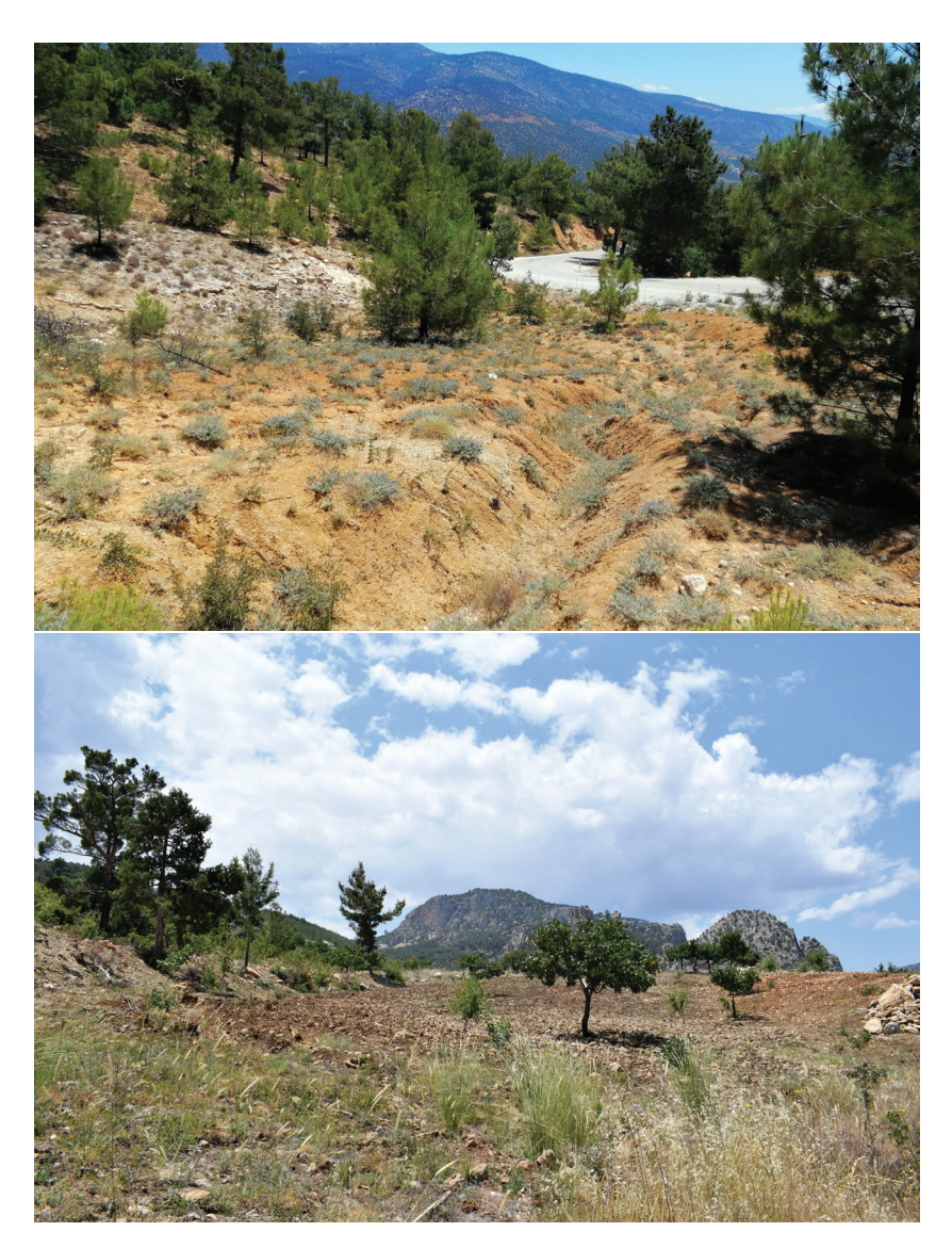
Figure 3: Habitats of Lotus sanguineus . Locality on open Pinus brutia forests and roadside in Kurucabel (above), locality on Pistachio orchards in Çukur village (above).

Slika 3: Rastišča vrste Lotus sanguineus. Lokacija v odprtem gozdu vrste Pinus brutia in na cestnem robu pri naselju Kurucabel (zgoraj), lokacija v nasadu pistacij pri vasi Çukur (spodaj).