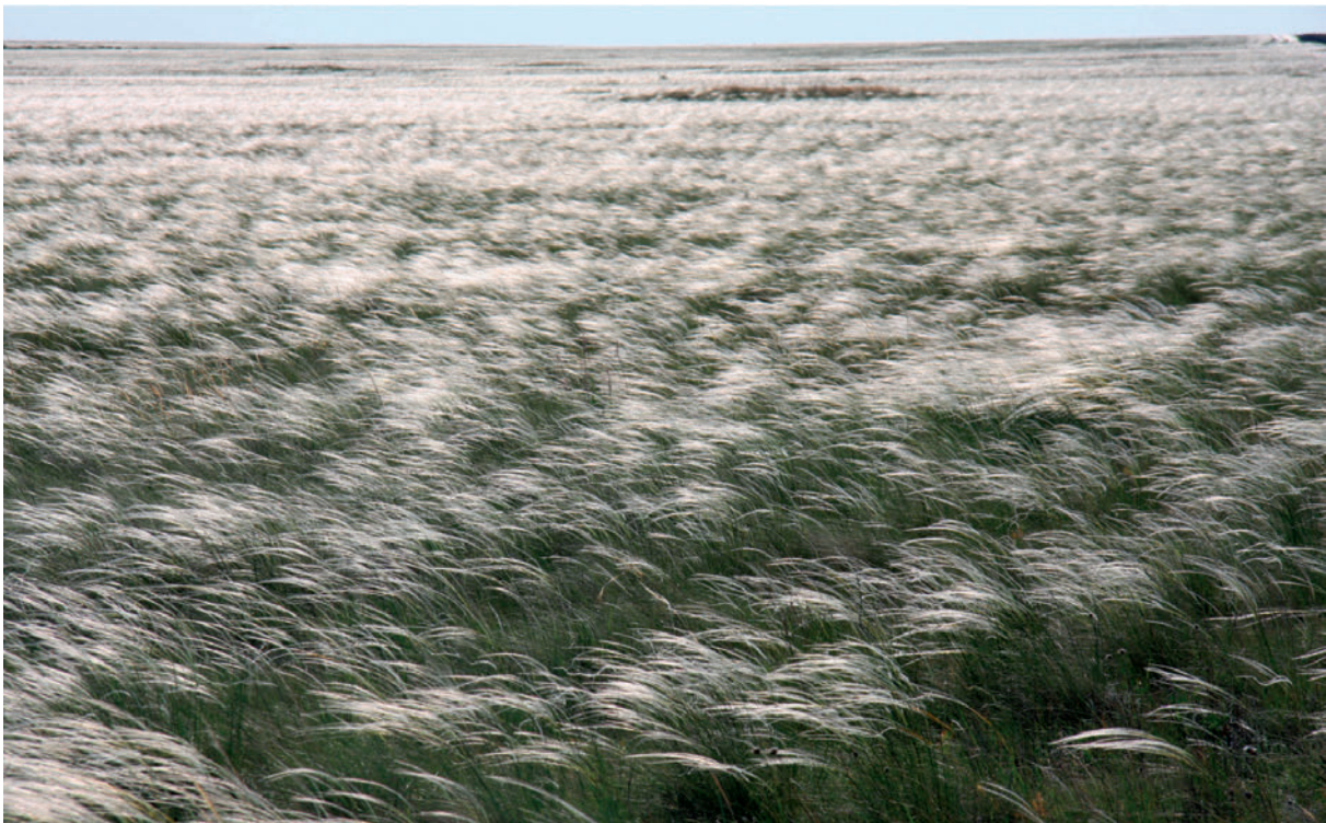
Figure 1: Temperate-dry bunch feather grass steppes (with Stipa lessingiana , Stipa capillata , Festuca valesiaca ) on the dark chestnut carbonate heavy loam soil, Turgai Plateau, Naurzum State Natural Reserve, Kazakhstan.

In total, dry steppes make up 7.1% (192,513.1 km 2 ) of the land area of Kazakhstan. Stipa lessingiana steppes were very common on the plains of the Sub-Ural and the Turgai Plateau. Fescue-feather grass ( Stipa lessingiana – Festuca valesiaca ) steppes with xerophytic forbs ( Galatella tatarica , Pyrethrum achillaeifolium ) on carbonate soils