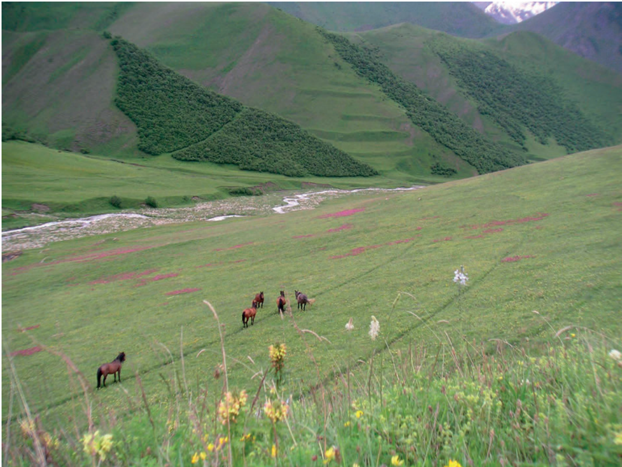
Figure 2: Typical landscape in the Central Caucasus, North Ossetia-Alania, Russia.