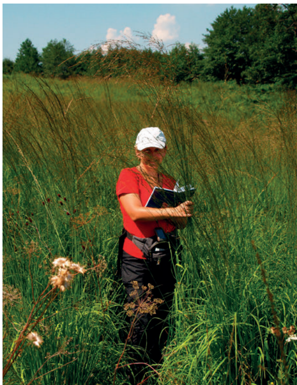
Figure 3: Molinia meadow in Ukraine. Slika 3: Travník iz zveze Molinia v Ukrajiní.

Molinia caerulea complex, which is represented by M. caerulea and M. arundinacea in south-western Ukraine. The authors separate vegetation associations in which Molinia occurred into nine different clusters, which differ between wet and dry species associations. They suggest that changes in Molinia occurrence were due to land-use changes. These land-use changes in southwestern Ukraine resemble those in other cultural landscapes: traditional land-use in this part of the landscape in the Carpathian Mountains, was regular haymaking. Haymaking served as a control for the spread of Molinia . In order to control the spread of Molinia also in the future, the application of a targeted management plan is needed, which should differ according to the vegetation association that is to be managed. In particular, M. caerulea associations should be managed differently from M. arundinacea communities. Such adapted management strategies that consider the seed maturation of the species are indeed important at a local scale to ensure either the maintenance of a particular plant community or to avoid the spread of very competitive species into adjacent, nutrient-poor biotopes. Eventually, management that helps maintain biodiversity in dry grasslands at a local scale, contributes to the conservation of biodiversity at regional and landscape scales. This paper emphasizes the importance of traditional land-