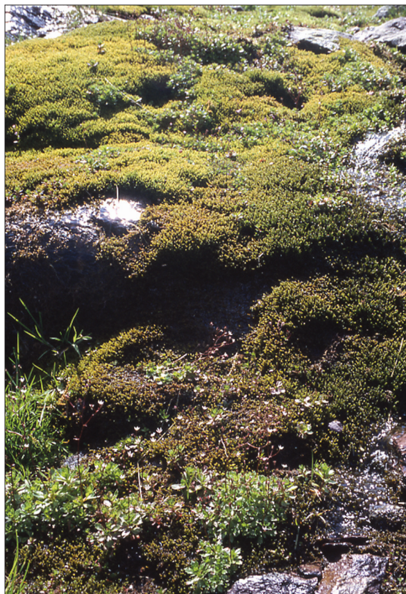
Figure 1: Stand of the association Cratoneuretum falcati Gams 1927 from the Swiss Alps (Murgsee, 1790 m a. s. l.).

io-Cardaminetalia and class Montio-Cardaminetea we noticed Saxifraga stellaris +3 ( I_c=26 ), S. aizoides +2 ( I_c=19 ) and Pinguicula alpina + ( I_c=4 ). Other species of various syntaxonomical groups have lower frequency and coverage values in the stands; in half of relevés we noticed Campanula cohlearifolia + ( Thlaspietea rotundifolii s. lat.), Parnassia palustris + and Poa alpina +1 ( Elyno-Seslerietea ), the last one as constant companion species of the association. Total floristic composition is evident in the phytosociological Table 1.