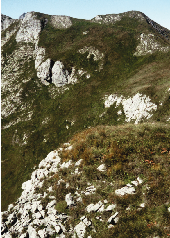
Figure 1: A general view on the typical biotope of the association Oxytropido carpaticae-Elynetum on limestone in the Belianske Tatry Mts.

Slika 1: Pogled na tipično rastišče asociacije Oxytropido carpaticae-Elynetum na apencu v gorovju Belianske Tatry.