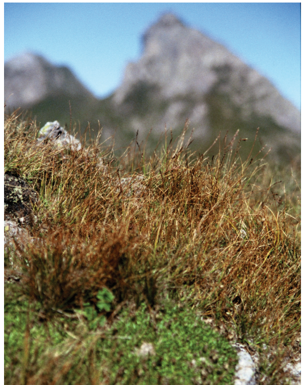
Figure 2: A tuft of wiry ( Elyna myosuroides ) is a dominant species.

Recently only two associations, namely Oxytropido carpaticae-Elynetum (Puşcaru & al. 1956) Coldea