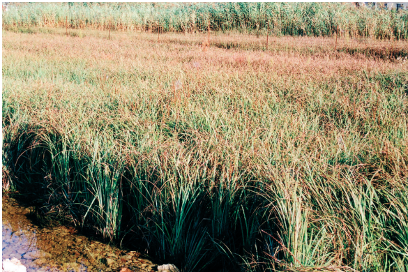
Figure 3: The surface of the Grosuplje Quaternary sediments is overgrown with sedges ( Magnocaricion ) and reeds ( Phragmition ).