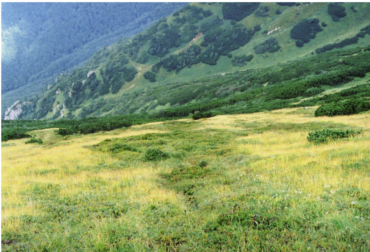
Figure 4: The stands of the association Hylocomio splendidis-Vaccinietum vitis-idaea probably develop from some moss-rich stands of the association Dryado octopetalae-Caricetum firmae in the moist under-ridge zone, which are not favourable for the fast decomposition of organic remains. In suitable places, both associations form a mosaic pattern (northern slope of the Malý Kriváň Mt., altitude 1570 m a. s. l., August 19 th 2002).

Slika 4: Sestoji asociacije Hylocomio splendidis-Vaccinietum vitis-idaea se verjetno razvijejo iz sestojev asociacije Dryado octopetalae-Caricetum firmae v vlažnem območju pod slemenom, kjer je razgradnja organskih ostankov počasna. Na primernih mestih se sestoji mozaično prepletajo (severno pobočje gore Malý Kriváň, nadmorska višina 1570 m, 19. avgust 2002).