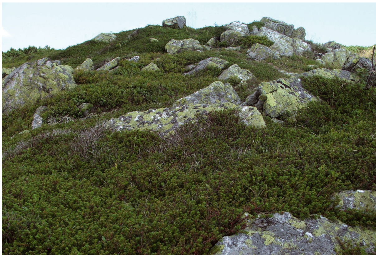
Figure 3: Empetrum nigrum s. l. determined physiognomy of the subassociation Cetrario-Vacciniteum vitis-idaeae empetrosum nigri . It prefers acidic bedrock and often occurs on boulder Pleistocene quartzite screes or slates (top of the bouldered Pleistocene quartzite scree near the spot height "Hrana Velkého Kriváňa", altitude 1618 m a. s. l., August 2 nd 2005).

Slika 3: Vrsta Empetrum nigrum s. l. določa fiziognomijo subasociacije Cetrario-Vacciniteum vitis-idaeae empetrosum nigri . Pojavlja se na kisli matični podlagi in na pliocenskem grušču in skrilavcih (na vrhu pleistocenskega balvana v bližini vrha "Hrana Velkého Kriváňa", nadmorska višina 1618 m, 2. avgust 2005).