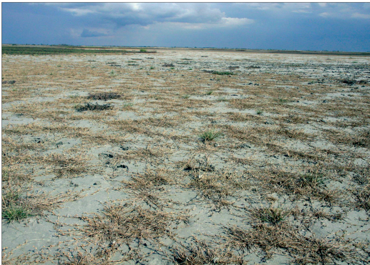
Figure 5: The Kelemen-Szék Lake in Hungary, typical association of Crypsidetum aculeatae on denuded saline bank.

Slika 5: Jezero Kelemen-Szék Lake na Madžarskem, tipična asociacija Crypsidetum aculeatae na golih slanah brežinah.