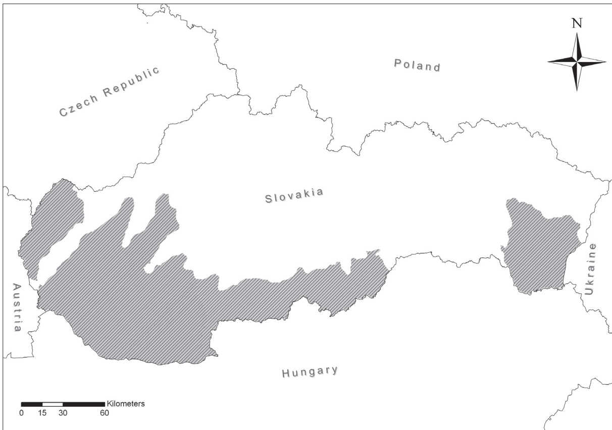
Figure 1: Area of study.