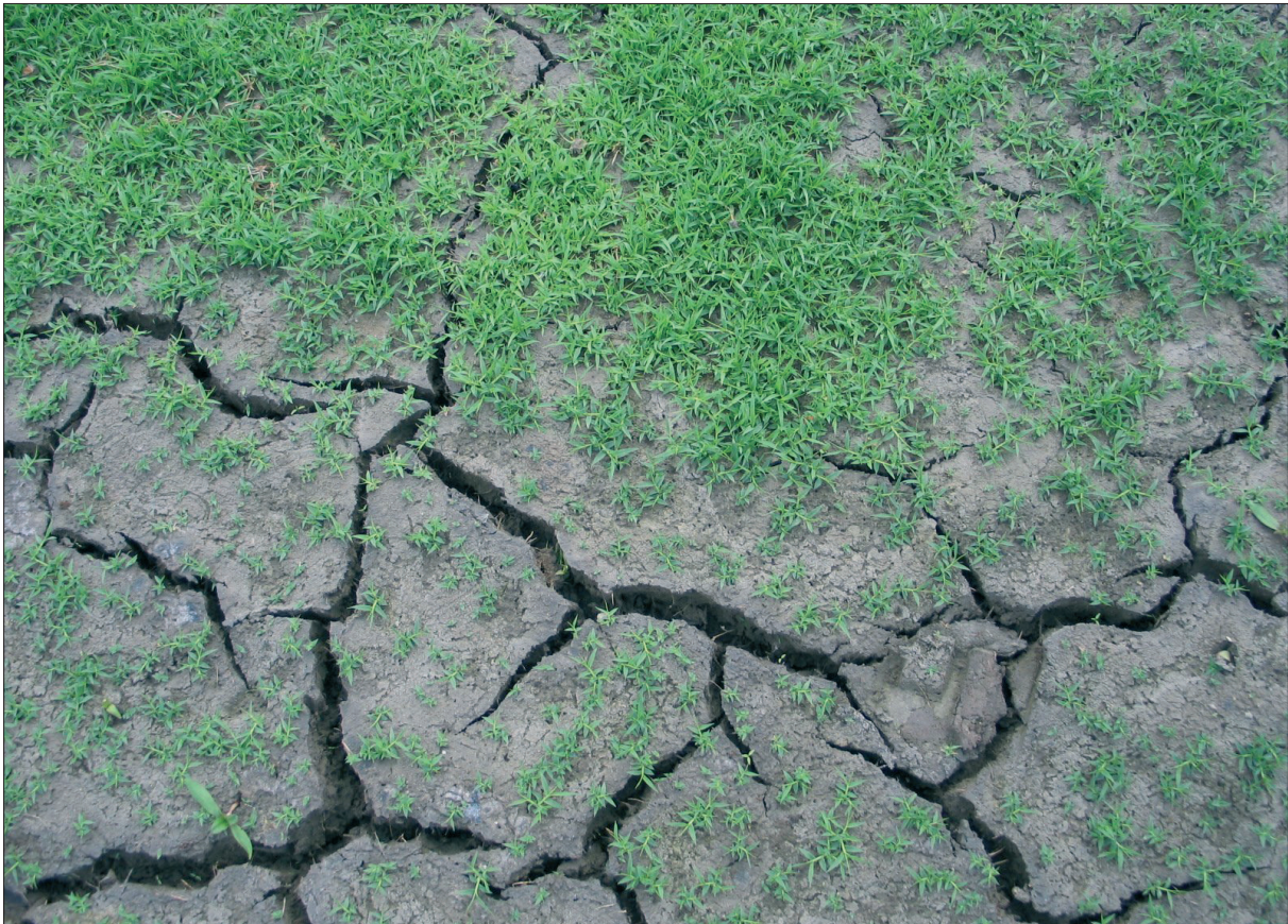
Figure 6: Heleochloetum schoenoidis on drying lake bank in Tvrdošovce.

Occurrence of vegetation with dominance of Heleochloa schoenoides was recorded at several localities during recent times. In 2004 we found typical vegetation mainly at the bottom of a small periodical pool near the Tvrdošovce railway station, (Tab. 1, relevés 1, 2, Fig. 6). It was distinguished by great dominance of the species (nearly 100 %) and low richness and abundance of other species (5 species in relevés with abundance to 5 %). Similar vegetation was found at a periodically flooded habitat of a field depression in the surroundings of the village of Močenok in 2006 (Tab. no. 1, relevés no. 12, 16–20). However, also many synanthropic species grew there. Other habitats of Heleochloa schoenoides were found on field margins and at open places strongly affected by man (field depressions, field roads, wet fallows, Fig. 7). The presence of ruderal species was caused by lower soil salinity and direct contact with intensively managed fields. Therefore