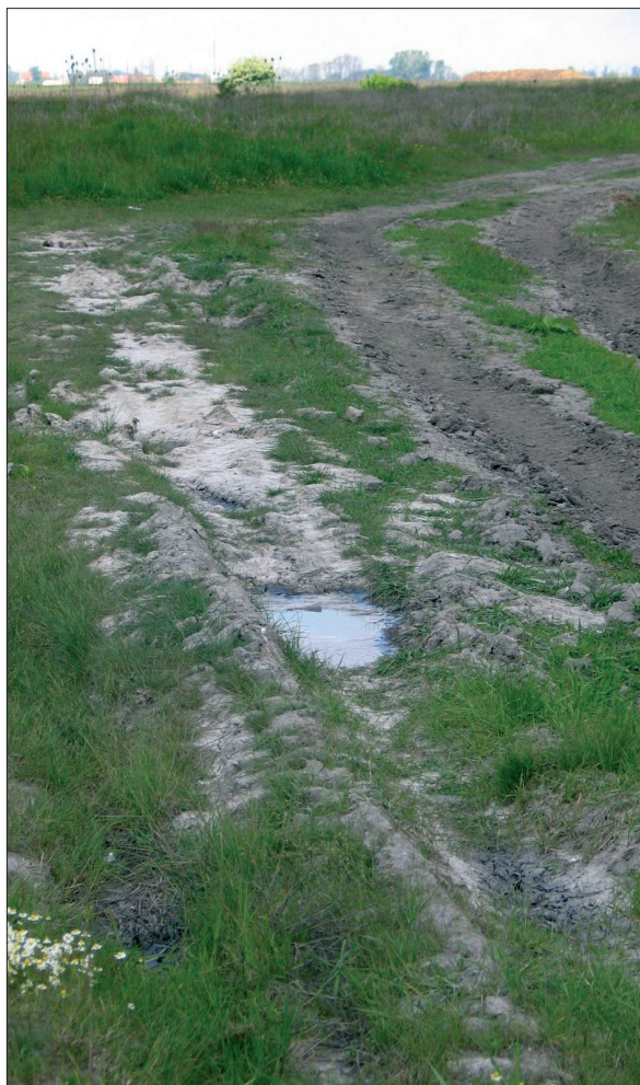
Figure 7: Rural roadside – a secondary habitat of Heleochloa schoenoides. 16. 7. 2005