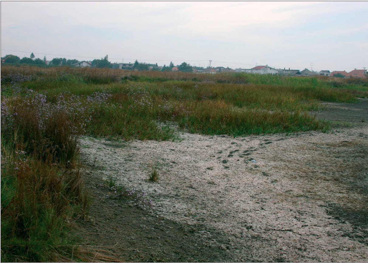
Figure 4: Village of Tvrdšovce: one of two last microsites of Crypsis aculeata in Slovakia. Denuded waterbanks of the small pool are in optimal conditions covered by an ephemeral community with presence of this species.

Slika 4: Pri vasi Tvrdšovce: eno od dveh zadnjih mikrorastišč vrste Crypsis aculeata na Slovaškem. Goli bregovi manjših mlak so v najugodnejših razmerah porasli z efemerno združbo te vrste. Foto: D. Dítě, 21. 9. 2004.