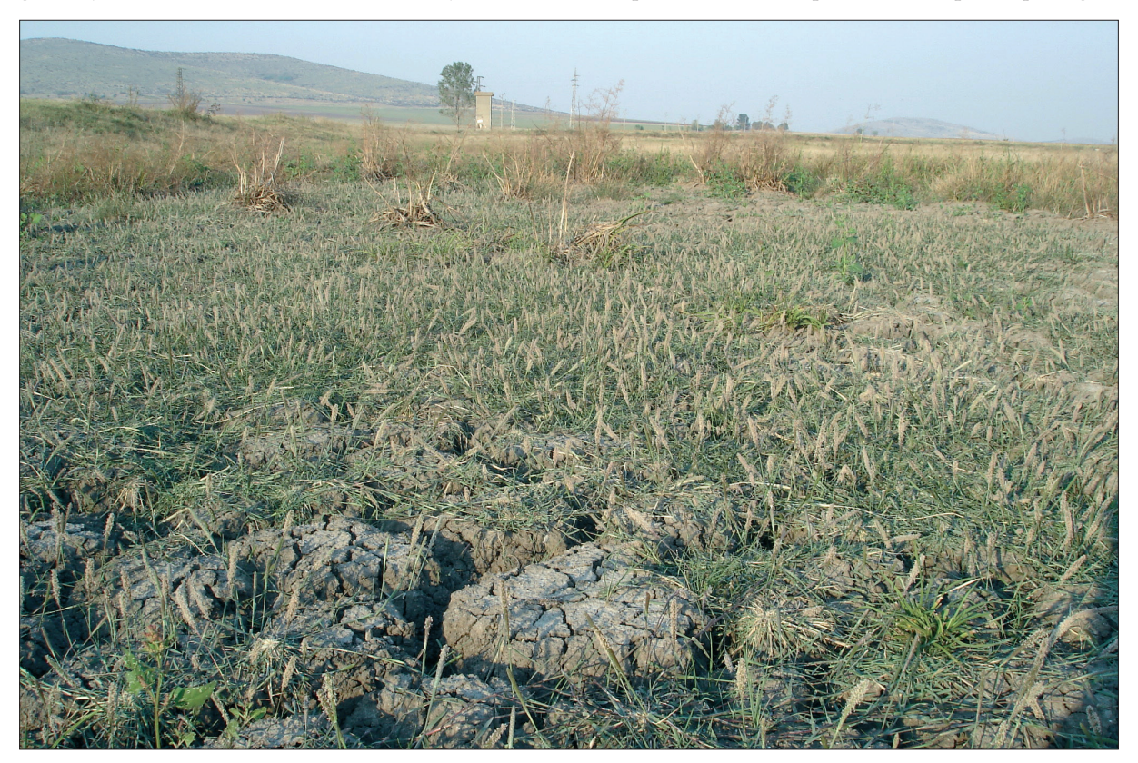
Figure 6 : The association Heleochloetum alopecuroidis in the locality near Radecki village (Stara Zagora District). Slika 6 : Asociacija Heleochloetum alopecuroidis v bližini vasi Radecki village (okrožje Stara Zagora).

This syntaxon (Table 2) is very similar to the previous one. The communities (Figure 6) described were near the villages of Rudnik (Burgas district) and Blatec (Sliven district). These pioneer communities occupy the drying bottoms of temporary pools, and their maximum development is soon after the receding of waters. The cover varies between 50 and 90 %. The phytocoenoses had poor species composition. Other species, often participating in