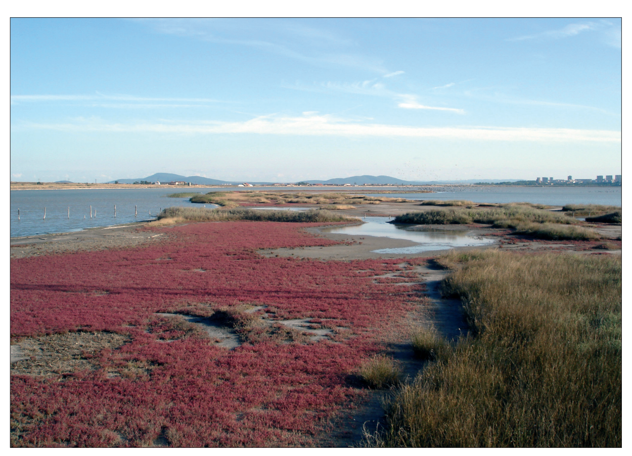
Figure 3 : The association Salicornietum europeae and Juncetum maritimae in Atanassovsko Lake near Burgas. Slika 3 : Asociaciji Salicornietum europeae in Juncetum maritimae ob jezeru Atanassovsko v bližini Burgasa.

The mono-dominant communities of Suaeda maritima were characterized as having limited distribution in Bulgaria by Ganchev et al. (1971). Only two phytocoenoses with the total size of 12 decares were described near Radnevo (Stara Zagora district) and Pomorie (Burgas district).