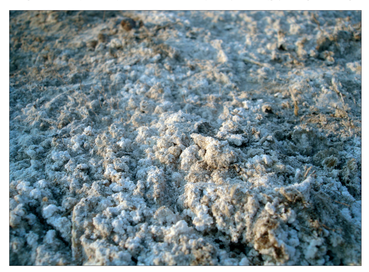
Figure 1: Typical saline soils. Slika 1: Tipična slana tla.

Relatively detailed investigation of the halophytic vegetation in these regions was carried out only by means of the dominant method (Ganchev et al. 1971). In the cited work the halophytic vegetation has been classified by the authors in two main groups – Euhalophytic (the formations and the associations of Salicornia europaea, Suaeda maritima, Salsola soda, Puccinellia convoluta, Aeluropus littoralis, Crypsis aculeata, Statice latifolia, Camphorosma monspeliaca, C. annua) and non-typical Halophytic (the association and formations of Hordeum hystrix, Juncus gerardii, Polypogon monspeliensis, Atriplex