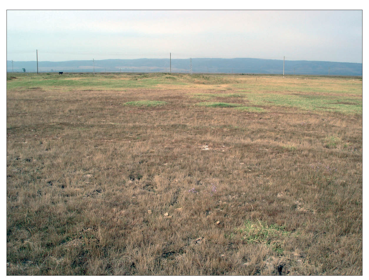
Figure 7 : The association Diantho-Puccinillietum convolutae in the locality near Atolovo village (Yambol District). Slika 7 : Asociacija Diantho-Puccinillietum convolutae pri vasi Atolovo (okrožje Yambol).

These communities occur on Solonetz soils. Most of them are of secondary origin from other saline types – Eutric Gleyosols, Gleyic Vertisols, and Fluvisols (Ninov 2002). The total cover of the phytocoenoses varied between 20 and 100 %, but was usually high – 80–90 %. Depending on the soil peculiarities, different species could form different sub-layers, which determine different facies of the association. The most important factor is the soil