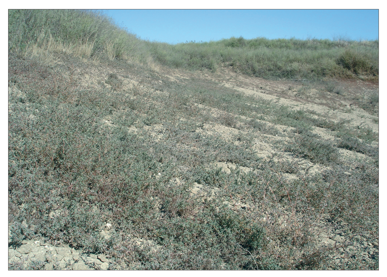
Figure 9: The association Petrosimonio brachiatae-Puccinillietum convolutae in Pomoriisko Lake (Burgas District). Slika 9: Asociacija Petrosimonio brachiatae-Puccinillietum convolutae ob jezeru Pomoriisko (okrožje Burgas).

cession stage of the drying of hyper-saline basins. The association Salicornietum prostratae develop on the wetter places. They surround the concentric belts of the communities of Petrosimonia brachiata and Puccinellia convoluta . These communities are more open (50–60 % cover) than the neighboring ones of Salicornietum prostratae and occupy very hard, dry salty mud. The coenoses are poor in species, with the obvious dominant role of the diagnostic species – Petrosimonia brachiata and Puccinellia convoluta .