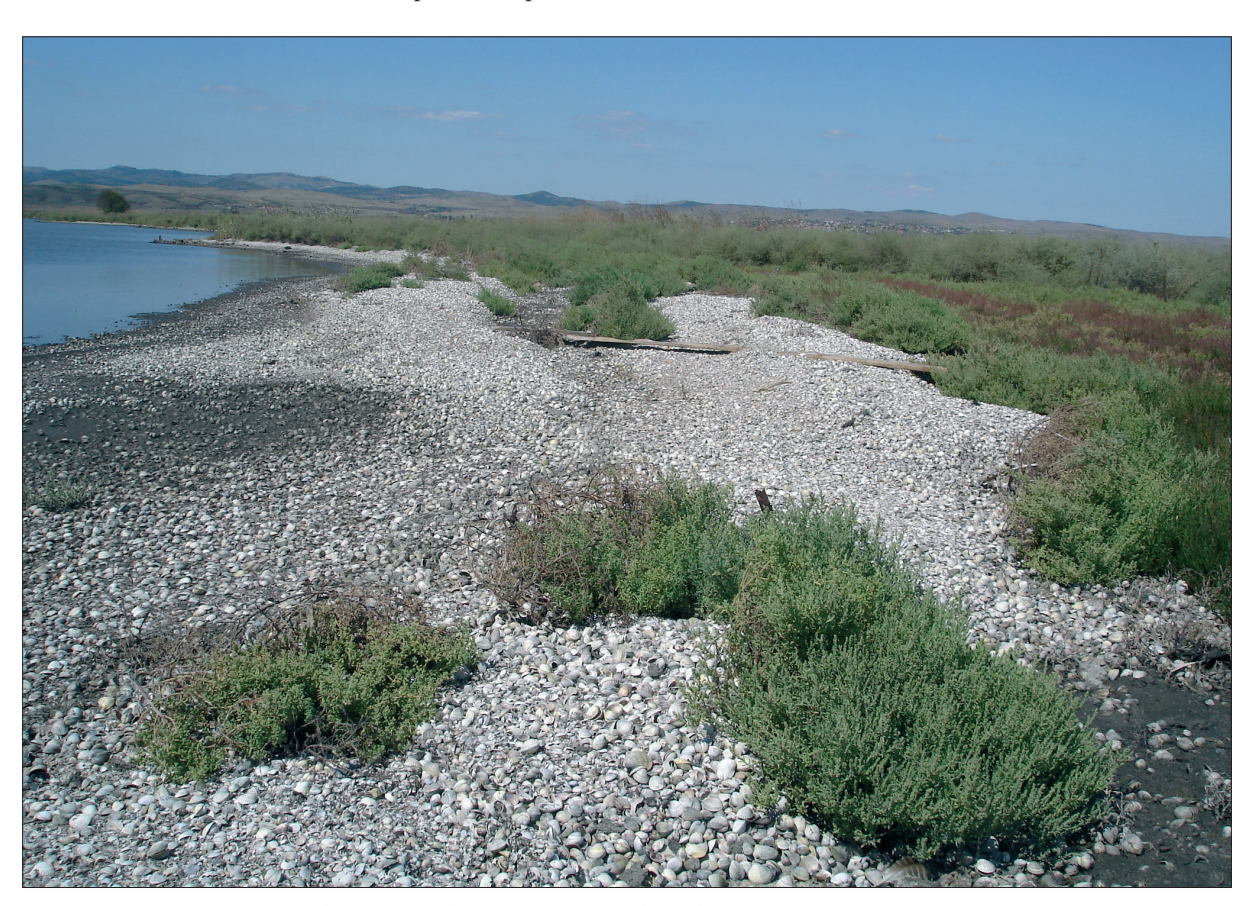
Figure 4: The association Suaedo-Bassietum hirsutae in Pomoriisko Lake (Burgas District). Slika 4: Asociacija Suaedo-Bassietum hirsutae ob jezeru Pomoriisko (okrožje Burgas).

This association (Table 1) is considered to be distributed in the Mediterranean region (Braun-Blanquet 1951), but according to Pott (1997) it is widespread in the Continental as well as in the Mediterranean coastal regions of Europe. This nitrophilous syntaxon is mentioned for the Black Sea coast for the first time by Topa (1939) and after that by Géhu et al. (1994). It is known also from the coastal zone of Greece (Babalonas et al. 1995). It is localized in the basins of Atanassovsko and Pomoiisko Lakes