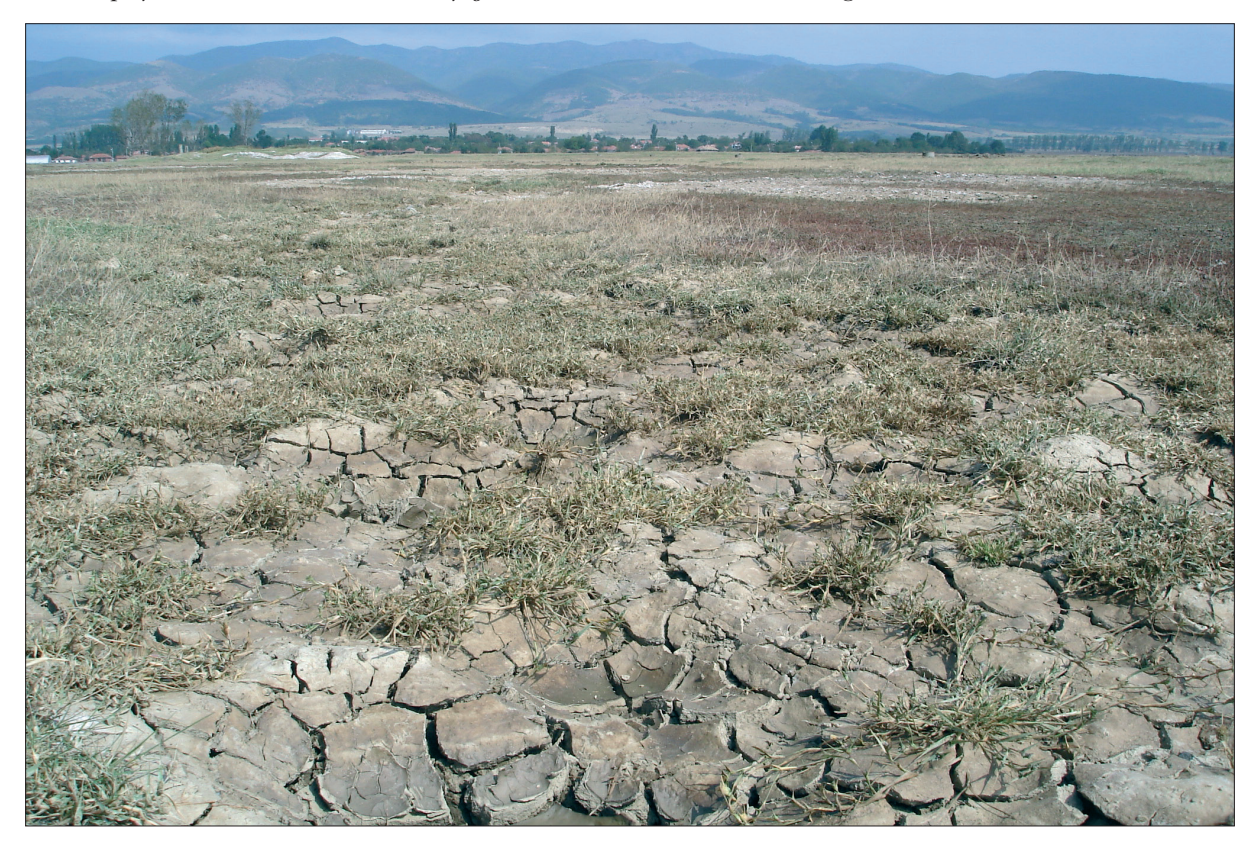
Figure 5: The association Crypsidetum aculeatae in the locality near Blatec village (Sliven District). Slika 5: Asociacija Crypsidetum aculeatae blizu vasi Blatec (okrožje Sliven).

This association (Table 2) belongs to the vegetation of the dry bottoms of the water bodies of different size. The phytocoenoses of Crypsis aculeata (Figure 5) were recorded near the villages of Radetski (Stara Zagora district), Blatec (Sliven dis-