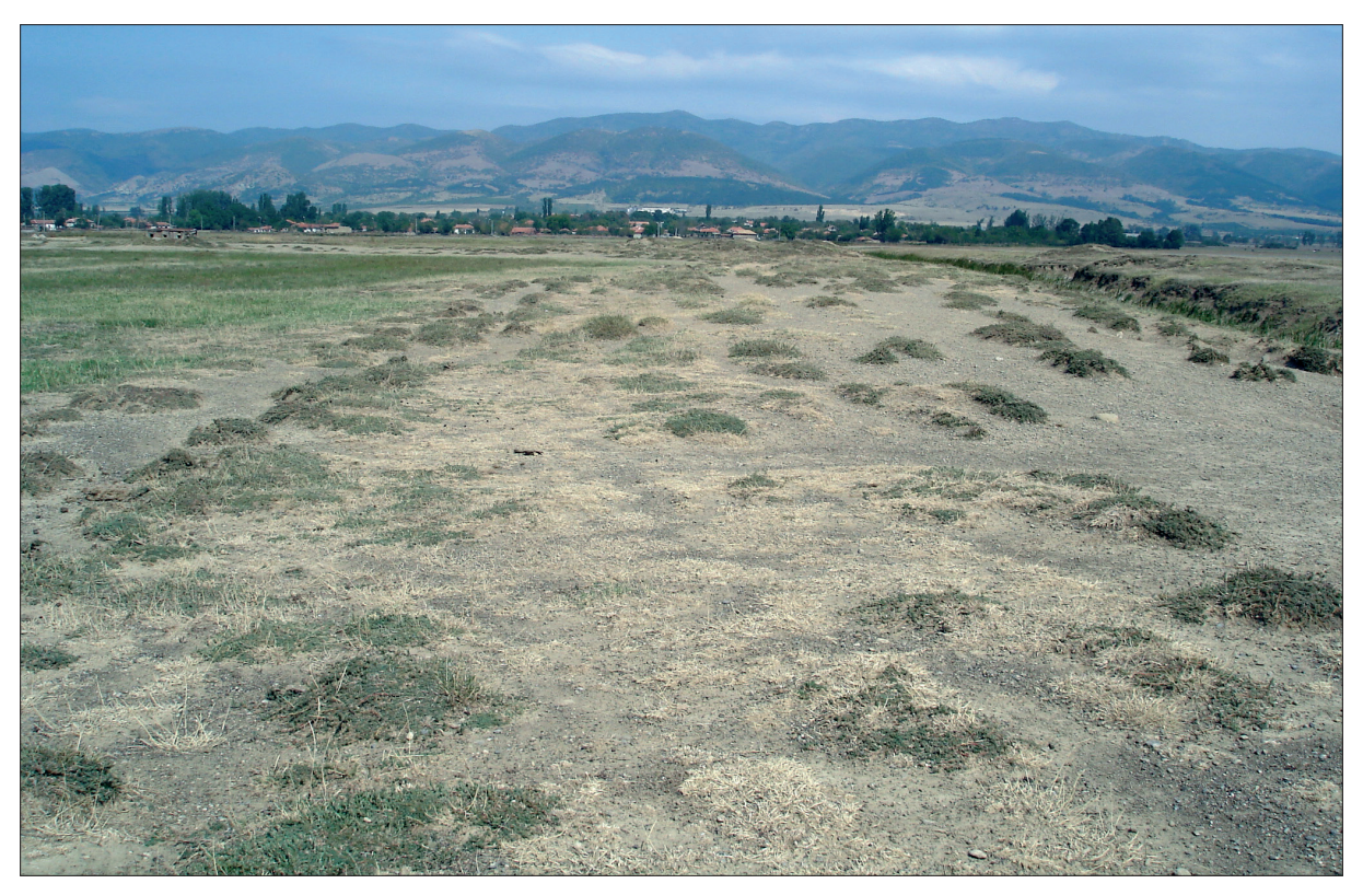
Figure 8: The association Bupleuro-Camphorosmetum monspeliacae in the locality near Zhelyu vojvoda village (Sliven District). Slika 8: Asociacija Bupleuro-Camphorosmetum monspeliacae pri vasi Zhelyu vojvoda (okrožje Sliven).

ciation were open and their cover was mostly about 60–70 %. The main species – Camphorosma monspeliaca formed small micro-eminences rising several centimetres above the neighboring flat ground. The size of these micro-eminences was about 0.5–1 m². The other more frequent species are Cynodon dactylon (IV), Puccinellia convoluta (IV), Bupleurum tenuissimum (III), Plantago lanceolata (II) and Polygonum pulchellum (II).