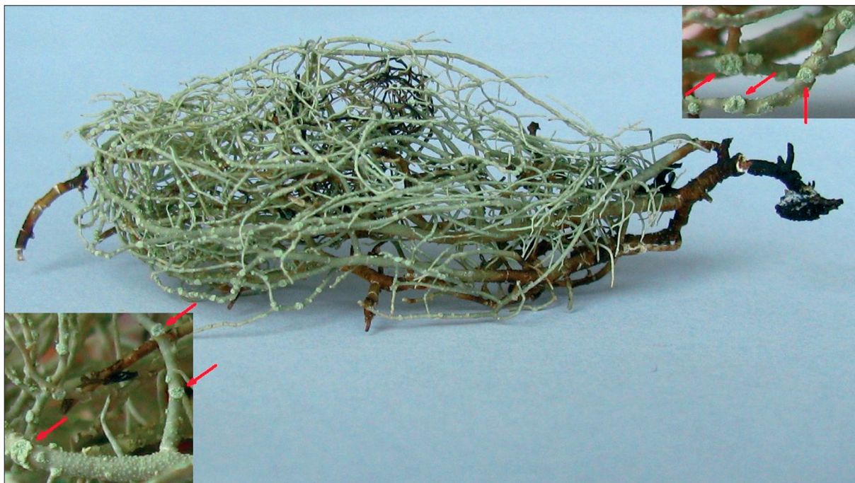
Figure 2: Thallus of collected U. glabrescens . Red arrows show soralia. Slika 2: Steljka nabranegega primerka U. glabrescens . Rdeča puščica nakazuje soralije.