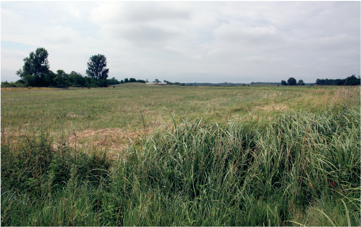
Figure 3: A part of Beckmannia eruciformis stand near Strážne. Slika 3: Del sestoja vrste Beckmannia eruciformis pri vasi Strážne.