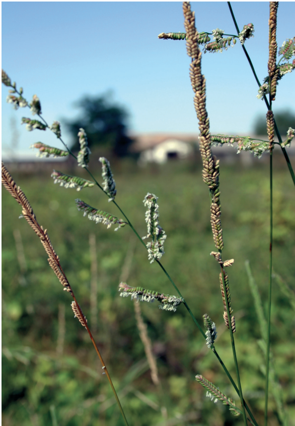
Figure 5: Typical inflorescence of Beckmannia eruciformis (Photo: Daniel Dítě).

Slika 5: Značilno socvetje vrste Beckmannia eruciformis . Foto: Daniel Dítě.