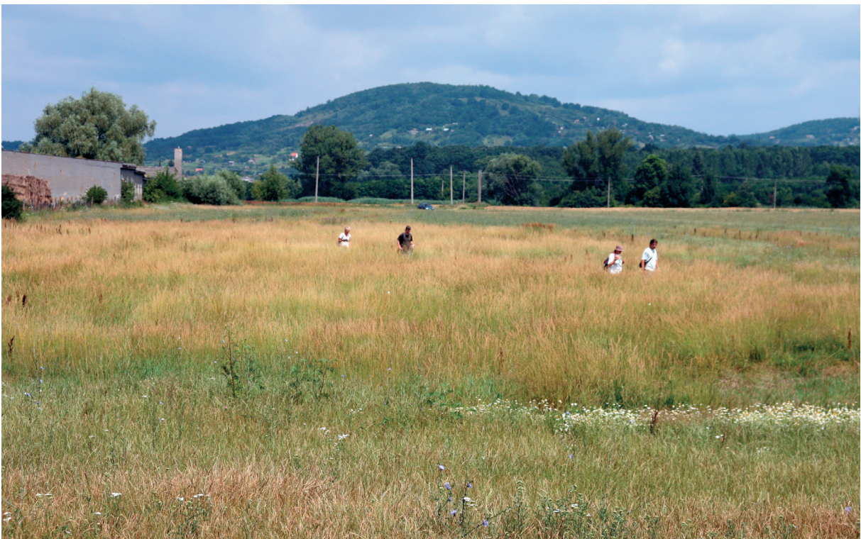
Figure 4: Ruderalized stand of Beckmannia eruciformis in Onča farmstead near the Malý Horeš village. Slika 4: Ruderaliziran sestoja vrste Beckmannia eruciformis na farmi Onča pri vasi Malý Horeš.