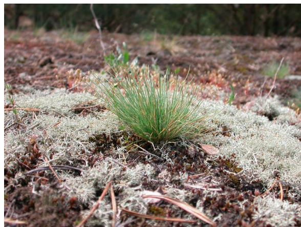
Figure 4: Corynephorus canescens growing in lichen carpet.

The natural pioneer communities from the alliance Corynephorion canescentis are generally poor in vascular plants but rich in lichens, primarily of the genus Cladonia (Table 1, Figure 4). The floristic composition of herb layer is conspicuously uniform in whole area of its distribution. Among initial components of natural succession belongs mostly Spergula morisonii , Teesdalia nudicaulis , Veronica dillenii (cf. Juškiewicz-Swaczyna 2009); in Eastern Europe also Thymus serpyllum (Chytrý 2007). Stands of Corynephorus -grasslands are obviously in this region named like separate association Thymo angustifolii-Corynephorum canescentis Krippel 1954 and more dense grasslands than as the Festuco dominii-Corynephorum Borhidi (1958) 1996. These are differentiated by Pannonian or continental species such as Carex ericetorum , Dianthus armeriastrum , D. serotinus ,