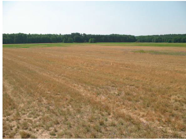
Figure 5: Abandoned field near Studienka with psammophyte vegetation.

22 years long succession on abandoned sandy fields in Denmark studied Deng (2001). According his observation the annual weeds fade out as first (during 3–5 years) and Jasione montana and Acetosella vulgaris became dominant, slowly supplement with persistent perennials such as Pilosella officinarum . The Corynephorus canescens grows