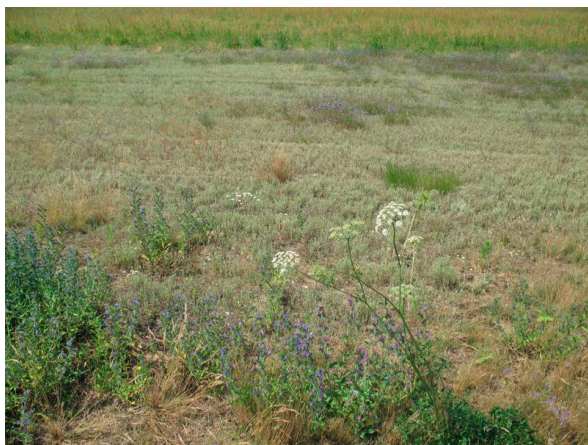
Figure 2: Weed Echium vulgare is replaced by oligotrophic Jasione montana and Logfia minima .

Slika 2: Plevel Echium vulgare nadomestita oligotrofní vrsti Jasione montana in Logfia minima .