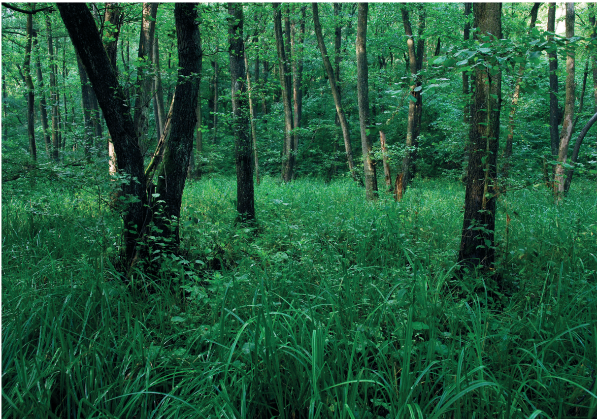
Figure 4: Physiognomy of forest understorey in the community of Carici acutiformis-Alnetum glutinosae created by Carex acutiformis.

ant species, mesophilous plants are presented only with lower frequency. In addition to the regular occurrence of species Plagiomnium undulatum , moss layer is locally formed by generalists of wet habitats (e.g. Atrichum undulatum , Plagiomnium affine s. lat.). In accord with the species composition pattern, we distinguished two alder forests at the level of variants. The Carici acutiformis-Alnetum glutinosae variant with Ligustrum vulgare consists of species-rich shrub layer including mainly species such as Acer campestre , Fraxinus excelsior , Ligustrum vulgare , Prunus spinosa and Swida sanguinea , whereas the stands of variant with Gallium palustre encompass only weakly developed shrub layer. On the other hand, the herb layer of latter one is also enriched with ferns ( Athyrium filix-femina , Dryopteris spec. div.) and moisture-demanding species (e.g. Cardamine amara , Juncus effusus , Persicaria hydropiper ). These variants are equally species-rich with means of 58 and 63 taxa per relevé, respectively (Table 1).