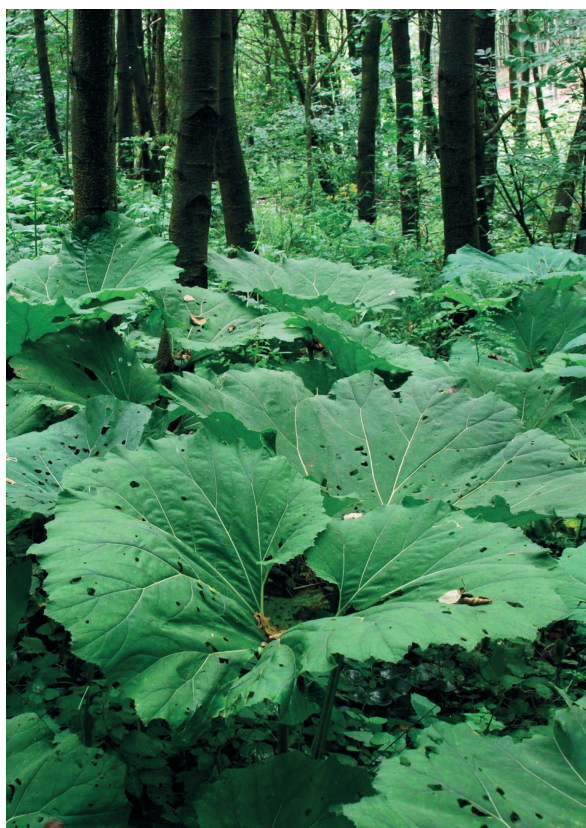
Figure 3: Mesophilous streamside forests with dominant species Petasites hybridus (, 19. 07. 2011, Velké Pole – Tomov štál).

Forest stands recorded within the association Stellario nemorum-Alnetum glutinosae are usually three-layered. The canopy closed tree layer is almost exclusively created by Alnus glutinosa , whereas the shrub layer is most often built up by Acer campestre and Corylus avellana (Table 2). The forest understorey contains species typical for various environmental microhabitats. In more detail, forest mesophilous plants (e.g. Brachypodium sylvaticum , Circaea lutetiana , Pulmonaria officinalis agg.) constantly grow in combination with more or less hygrophilous (e.g. Caltha palustris , Impatiens noli-tangere ) and nitrophilous species ( Aegopodium podagraria , Galium aparine , Glechoma hederacea , Urtica dioica ; Table 2, Figure 2a). The physiognomy of herb layer is determined by dominant presence of the Urtica dioica . Other species such as Glechoma hederacea and Petasites hybridus reach higher cover values only occasionally (Figure 3). Higher frequency is charac-