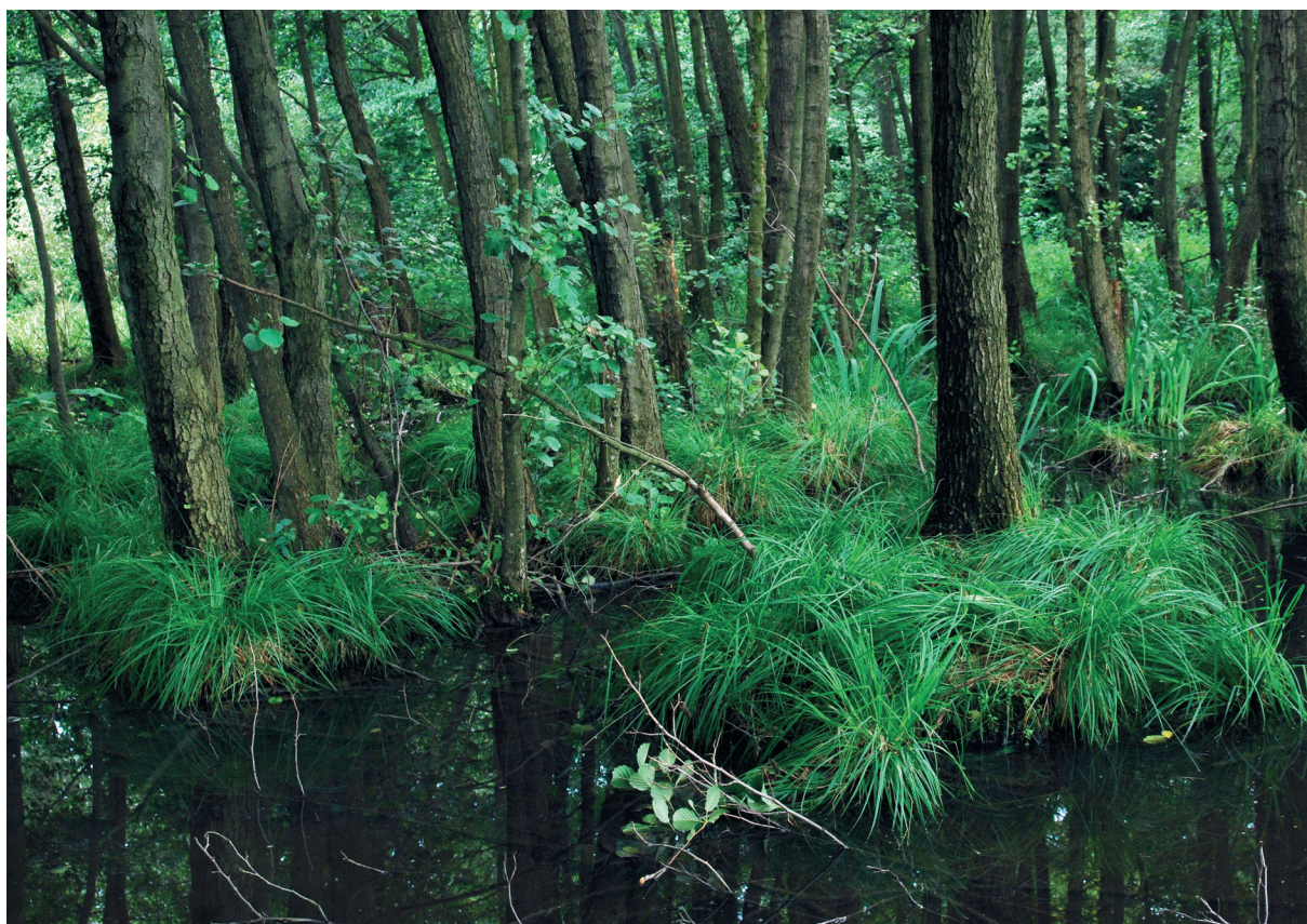
Figure 5: Microrelief heterogeneity in alder carr forests of Carici elongatae-Alnetum glutinosae with presence of hummocks and stagnant water on soil surface in hollows (, 22. 07. 2011, Nemečky).

E 0 : Plagiothecium denticulatum 1, Atrichum undulatum +, Brachythecium rutabulum +, Herzogiella seligeri r, Lophocolea heterophylla r.