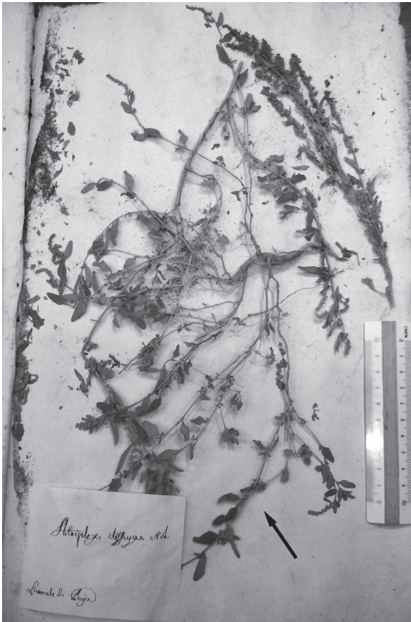
Figure 2: Lectotype (arrow indicates the lectotype) of the name Atriplex diffusa Ten. (NAP).

Figure 2: Lektotip (puščica kaže na lektotip) imena Atriplex diffusa Ten. (NAP).