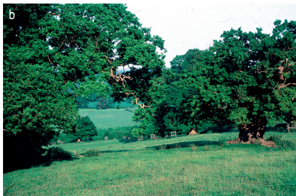
Figure 3: Typical views of (a) Staverton Park showing a high density of old trees and of (b) Moccas Park which is much more open. (Photographs by the author).

Slika 3: Značilen izgled (a) Staverton Park z visoko gostoto starih dreves in (b) Moccas Park, ki je bolj odprt. (Fotografije avtorja).