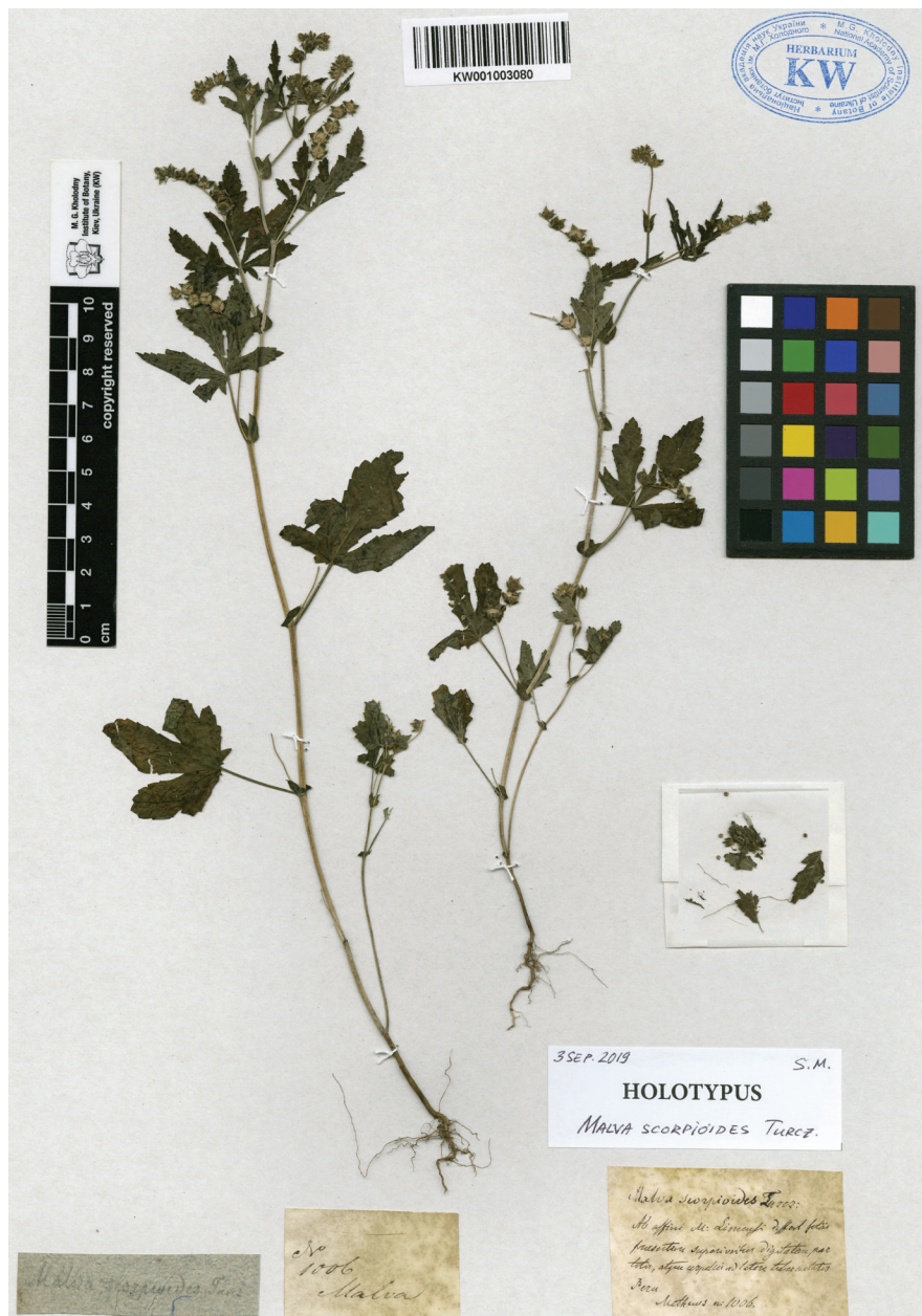
Figure 3: Holotype of the name Malva scorpioides Turcz. (KW001003080).