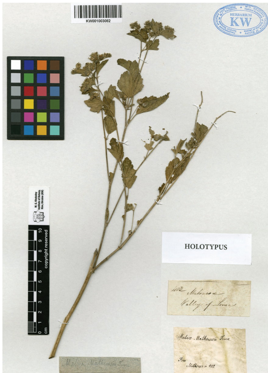
Figure 4: Holotype of the name Malva mathewsii Turcz. (KW001003082).

Slika 4: Holotip imena Malva mathewsii Turcz. (KW001003082).