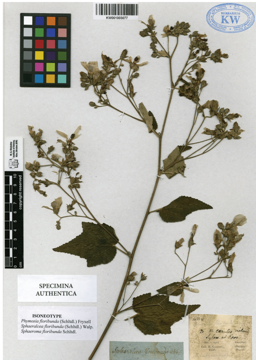
Figure 2: Isonotype of the name Sphaeroma floribunda Schltl. (KW001003077).