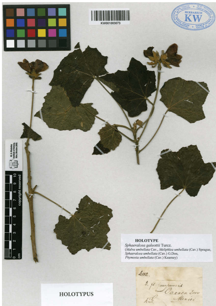
Figure 1: Holotype of the name Sphaeralcea galeottii Turcz. (KW001003073).