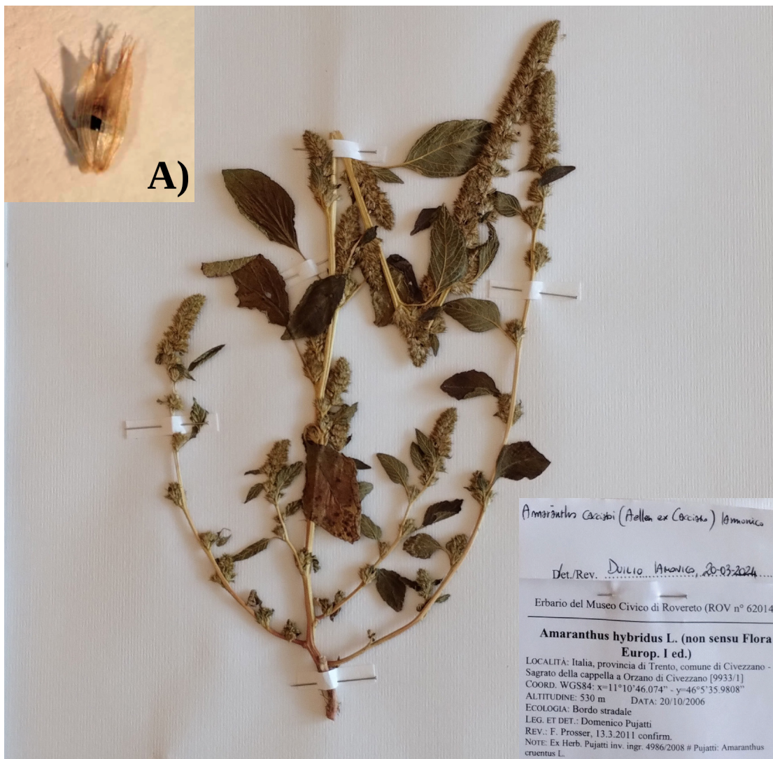
Figure 1: Specimen of Amaranthus cacciatoi collected in Veneto; A) detail of the perianth (ROV62014). Slika 1: Primerek vrste Amaranthus cacciatoi , nabran v Venetu; A) detajl cvetnega odevala (ROV62014).

(RO!); Roma, via Appia Nuova, all'altezza di via delle Capannelle, incolti al margine della strada, 15 September 2008, Iamónico s.n. (RO!). Trentino-Alto Adige: provincia di Trento, comune di Divezzano, Sagrato della cappella Orzano di Divezzano bordo stradale, 530 m, 20 October 2006, leg. Et det. Pujatti 9933/1 , rev. Prosser (sub Amaranthus hybridus ), rev. Iamónico , 20 March 2024 (ROV62014); provincia di Trento, comune di Tassullo, Val di Non, tra Tassullo e la forra di S. Giustina, meletto, 500 m, 18 October 2012, leg. Prosser, Bertolli et Andreatta 9632/3 , det. Prosser (sub Amaranthus hybridus ), rev. D. Iamónico , 20 March 2024 (ROV60075). Veneto: Belluno, Frontal di Lentiai (Borgo Valbelluna), 575 m, 30 October 2023, leg. C. Argenti , rev. D. Iamónico (PAD, RO, Herbarium Argenti).