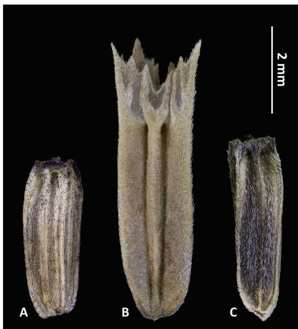
Figure 2: Carpomorphological comparison of achenes: A) Dipsacus fullonum ; B) D. gmelinii and C) D. laciniatus . Photo: I. Kostadinov.

Slika 2: Primerjava karpomorfoloških znakov rožk: A) Dipsacus fullonum ; B) D. gmelinii and C) D. laciniatus . Photo: I. Kostadinov.