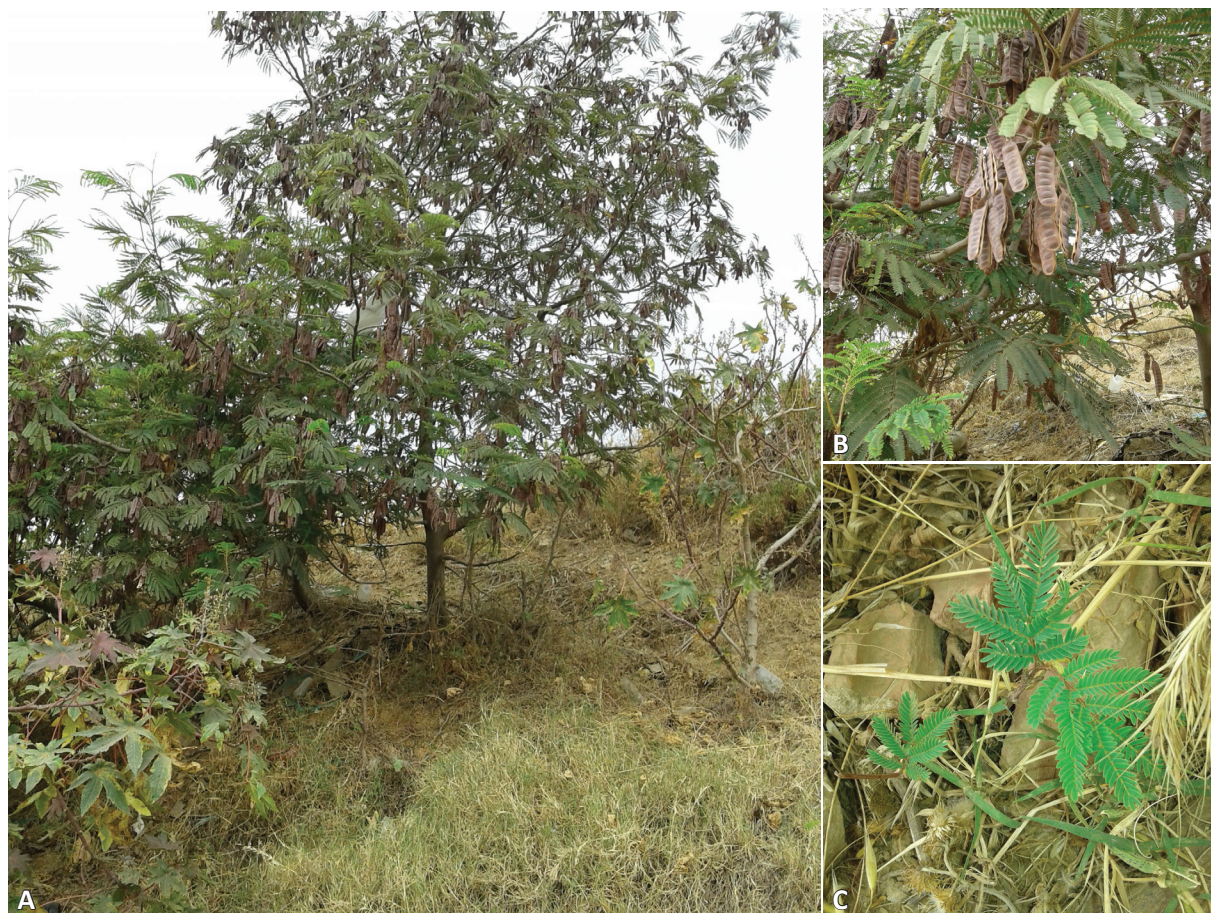
Figure 2. Paraserianthes lophantha in Algeria. A: biotope of one of the populations observed at the Bouaabaz station (Skikda, north-eastern Algeria); B: fruit detail; C: young seedlings.

A population was found on 05. 04. 2021 on the edge of the road passing next to the ‘Bourchek Ziden’ primary school in the forest of Filfilla Mountain. It consisted of more than 50 young individuals varying in size from 70 cm to 3.50 m and was observed mixed with native species such as Clematis cirrhosa L., Pistacia lentiscus L., Rubus ulmifolius Schott and Smilax aspera L. This population was observed again on 06. 06. 2021 and on 29.10.2022 (Figure 3C. Another small subpopulation, consisting of three old individuals, one of which is about 7.50 m high, was found at the edge of the ‘chaâba’ passing under the small bridge (Figure 3A, 3B). This subpopulation is perfectly adapted to its environment and completely mixed with native forest plants such as Alnus glutinosa (L.) Gaertn., Ceratonia siliqua L., Olea europaea L., Phillyrea