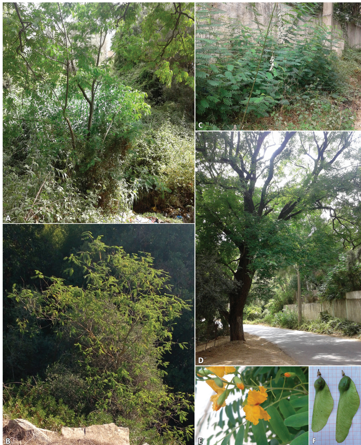
Figure 3. Tipuana tipu in Algeria. A : a young tree in a 'chaaba' (= small stream in a shallow depression) in Filfilla (Skikda, northeastern Algeria); B : a young tree growing amidst native forest species; C : population of young self-sown individuals; D : adult tree responsible for the appearance of the species in the forest of Filfilla. E : flowers; F : fruit details. Slika 3. Tipuana tipu v Alžiriji. A : mlado drevo v 'chaaba' (= majhen potok v plitvi depresiji) v območju Filfilla (Skikda, severovzhodna Alžirija); B : mlado drevo med avtohtonimi gozdnimi vrstami; C : populacija mladih, spontano rastočih osebkov; D : odraslo drevo, izvorni osebek vrste v gozdu na območju Filfilla. E : cvetovi; F : plod.