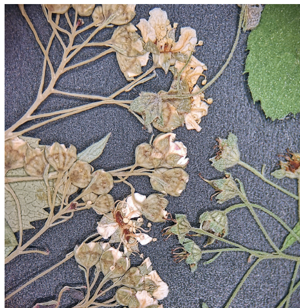
Figure 7: Spiraea decumbens subsp. decumbens (Breginj – Prekopa, Leg. B. Vreš) – left and Spiraea decumbens subsp. tomentosa (Govci) – right.

Slika 6: Hacquetova medvejka ( Spiraea decumbens subsp. tomentosa ), posnetek socvetja.