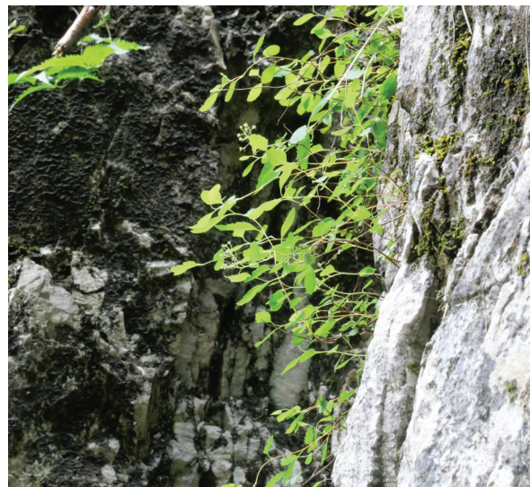
Figure 5: Spiraea decumbens subsp. tomentosa under Mt. Poldanovec, close-up.

Slika 4: Populacija Hacquetove medvejke ( Spiraea decumbens subsp. tomentosa ) pod Poldanovcem.