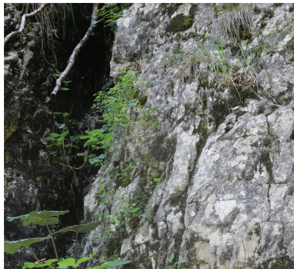
Figure 4: Population of Spiraea decumbens subsp. tomentosa under Mt. Poldanovec.

Slika 4: Populacija Hacquetove medvejke ( Spiraea decumbens subsp. tomentosa ) pod Poldanovcem.