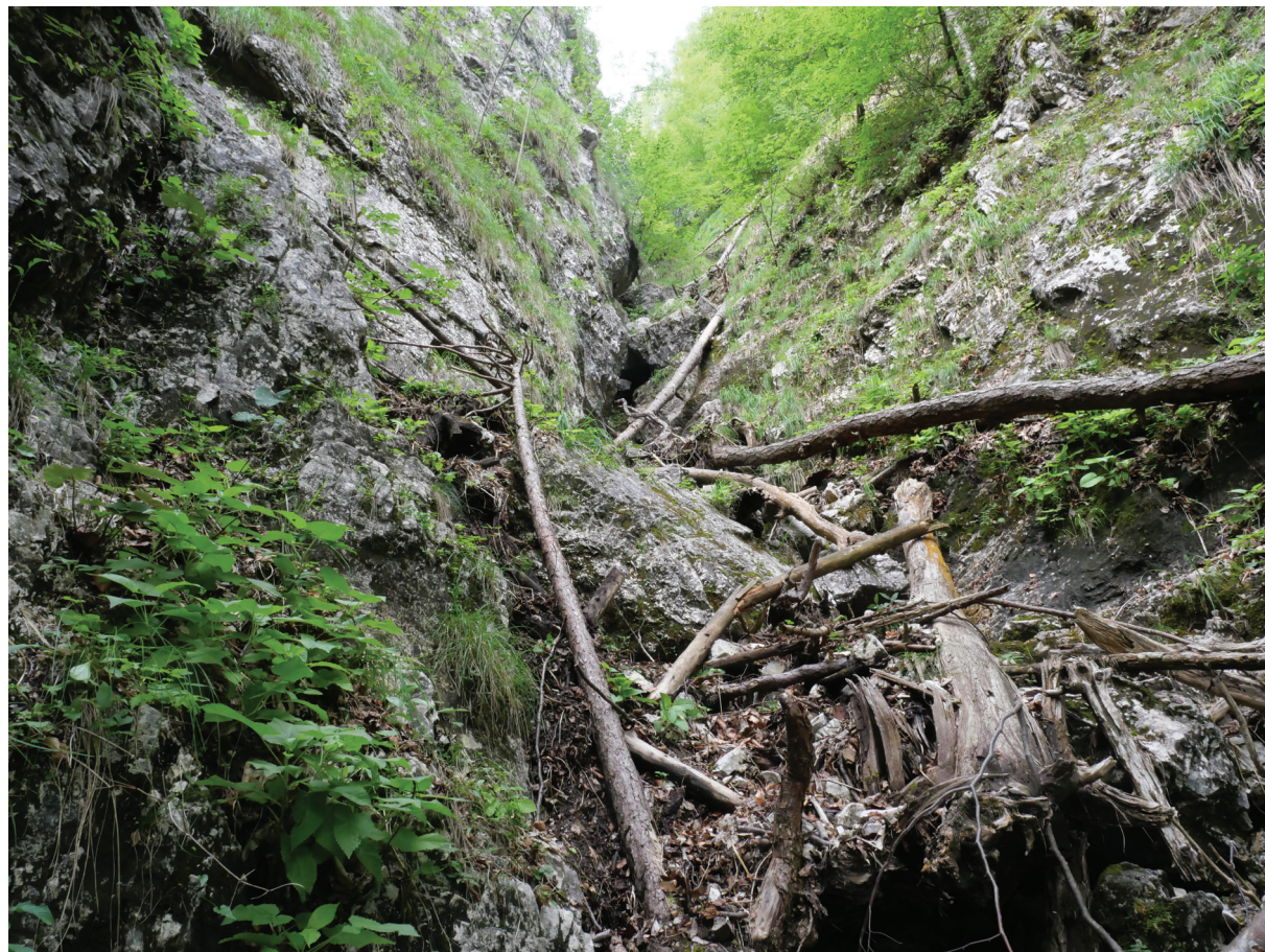
Figure 3: Gorge under Mt. Poldanovec, locality of Spiraea decumbens subsp. tomentosa .

Slika 3: Grapa pod Poldanovcem, kjer je nahajališče Hacquetove medvejke ( Spiraea decumbens subsp. tomentosa ).