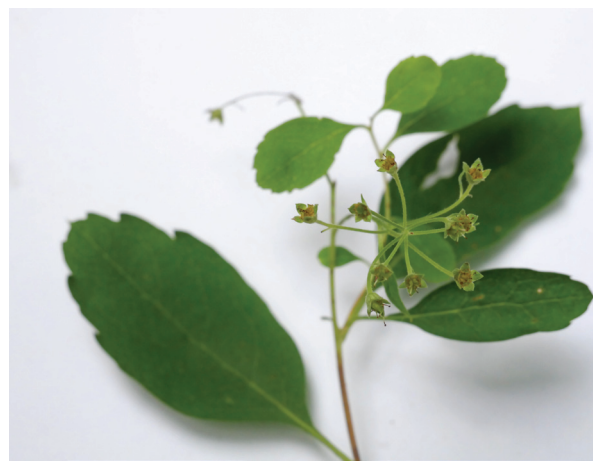
Figure 6: Spiraea decumbens subsp. tomentosa , inflorescence.

Slika 5: Hacquetova medvejka ( Spiraea decumbens subsp. tomentosa ) pod Poldanovcem, bližnji pogled.