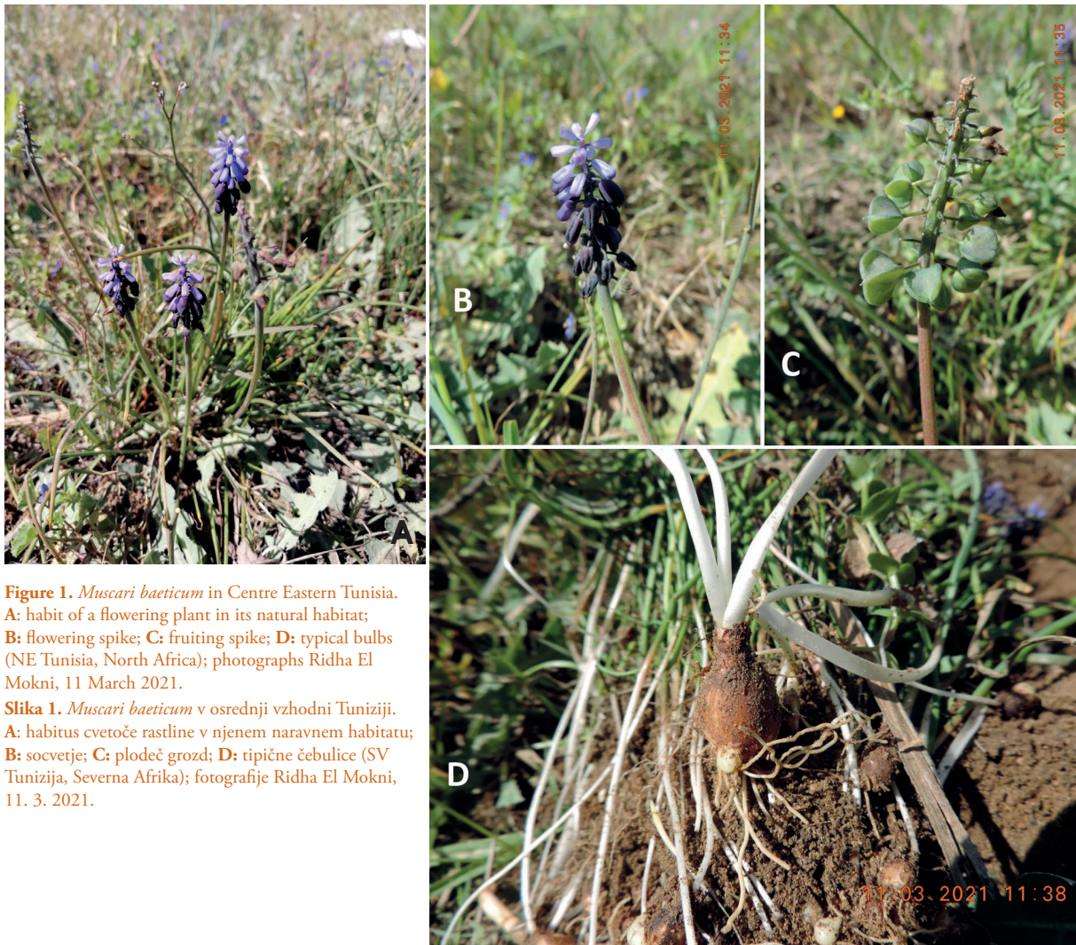
Figure 1. Muscari baeticum in Centre Eastern Tunisia. A: habit of a flowering plant in its natural habitat; B: flowering spike; C: fruiting spike; D: typical bulbs (NE Tunisia, North Africa); photographs Ridha El Mokni, 11 March 2021.