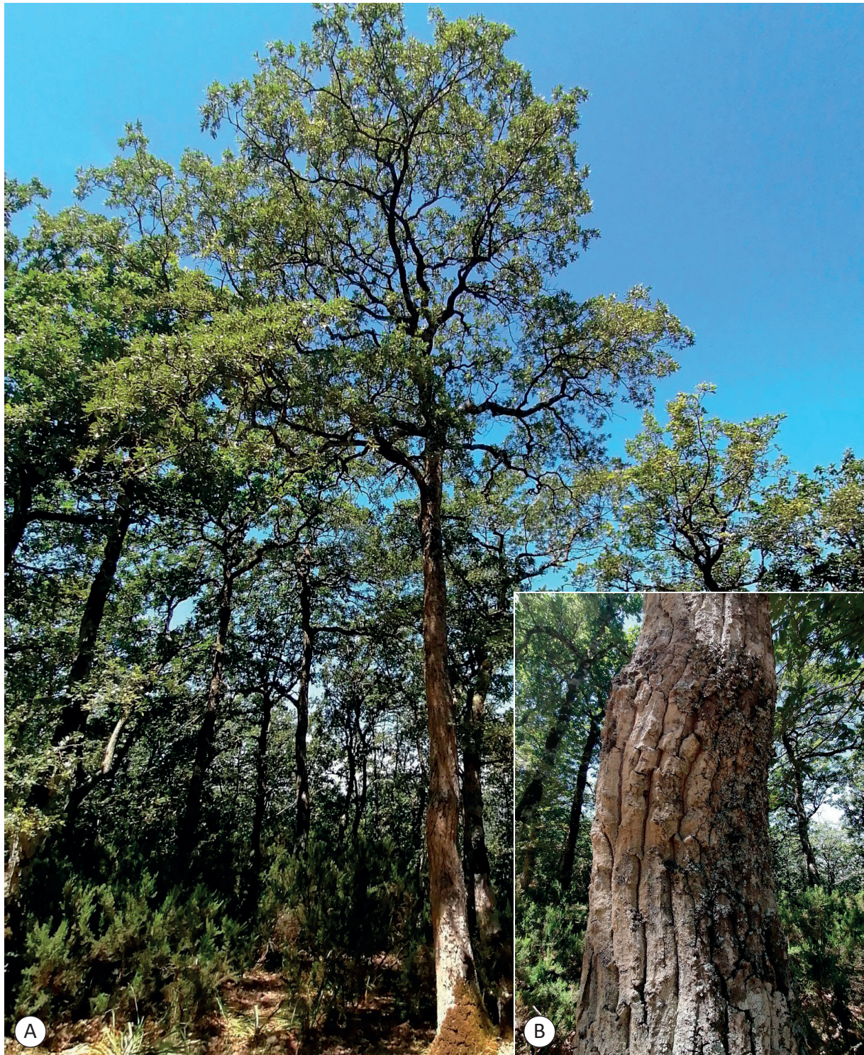
Figure 2: Quercus ×numidica (syn. Q. ×kabylica by Trabut 1890) in Kroumirian oak forests; A: habit of a tree in its natural habitat; B: part of the trunk with somewhat corky bark; C: crown; D: typical leaves; E: cups. (Jendouba, NW Tunisia, North Africa; 16.6.2020).

Slika 2: Quercus ×numidica (syn. Q. ×kabylica Trabut 1890) v hrastovih gozdovih na območju Kroumiria; A: drevesa na naravnem rastišču; B: del debla z nekoliko oplutenelim lubjem; C: krošnja; D: značilni listi; E: plod. (Jendouba, SZ Tunizija, Severna Afrika; 16. 6. 2020).