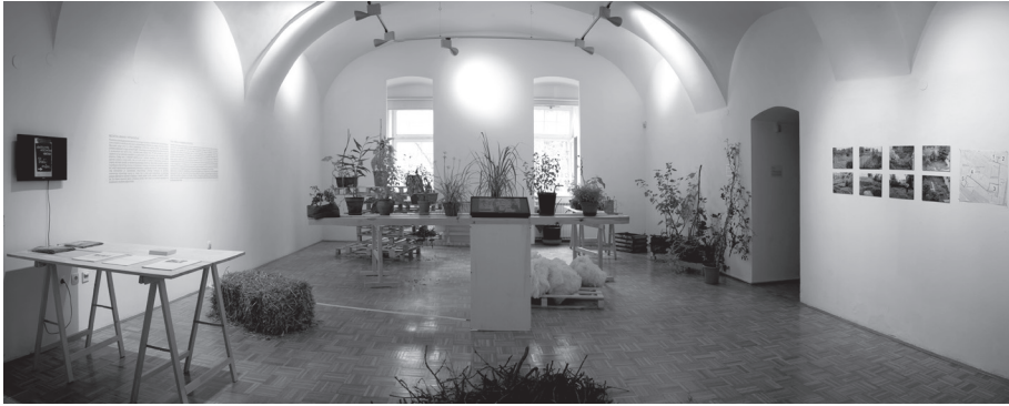
Fig. 5: Andreja Džakušič, Hanging Gardens , 2015, installation view at the Gallery of Contemporary Art Celje (as part of the exhibition We Meet at Six: Proposals for Communal Practices and Green Areas in Celje ).

These artists are interested not merely in the overlooked aspects of the local urban space in their research, but also in the relationships with the local residents of the space of exploration itself, as well as in the aesthetic and conceptual relationships with the gallery audience and the general public. The participatory process at a specific location itself does not actually have a secondary audience, which makes the public critical discourse in the form of an exhibition all the more important. (Fig. 5) Creating works/projects following the principles of participation is necessarily integrated into a network of connections with specific historical and socio-political contexts as well as everyday life situations.