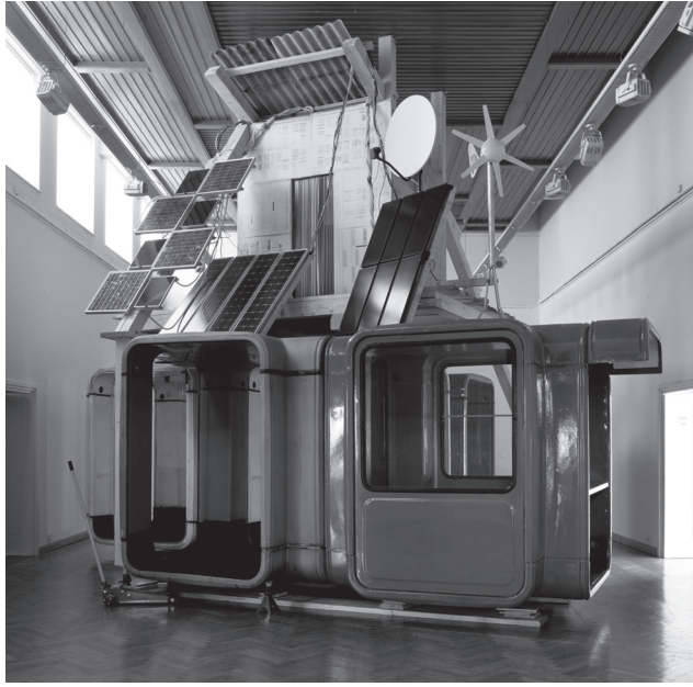
Fig. 2: Marjetica Potrč, Next Stop, Kiosk , 2003, mixed media: a house-jack, a group of urban kiosks (the System K-67 kiosks were originally designed by the Ljubljana-based architect Saša J. Mächtig in the late 1960s; they could serve as a basis for a mobile dwelling unit), with reference to a South American palafita —a house on stilts—and the illegal rooftop houses of Belgrade; installation view at the Moderna galerija, Ljubljana.

main difference lies in the fact that their post-minimalist predecessors can be addressed in a broader sculptural context, 42 whereas contemporary artists work in “an expanded, cross-disciplinary field”, which can also include research, similar to the work of a geographer, social worker, anthropologist, activist or experimental architect, etc. 43